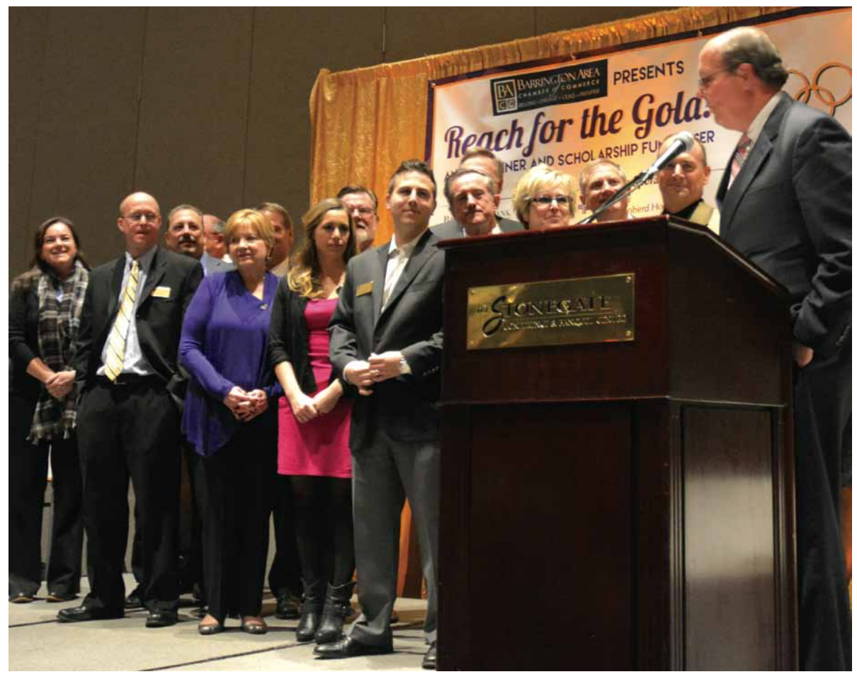
BACC annual Dinner and Scholarship Fundraiser to be held on January 19 at the Stonegate.