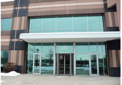
The DaVita Dialysis Barrington Creek location in Lake Barrington.