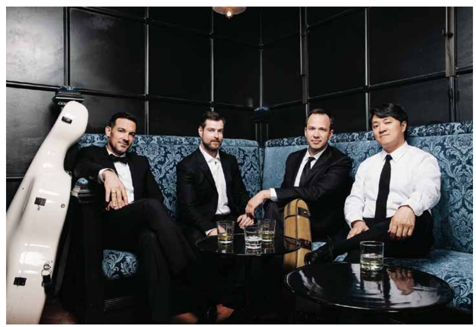
Miró String Quartet