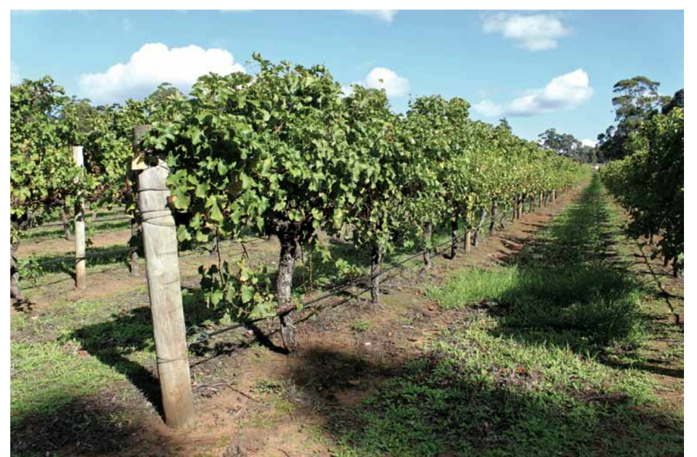
The wine region near Margaret River in Western Australia.