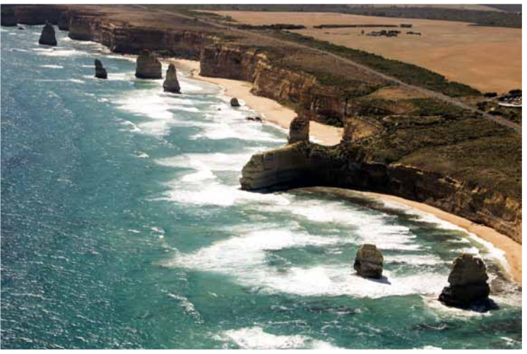
The Twelve Apostles near Great Ocean Road.