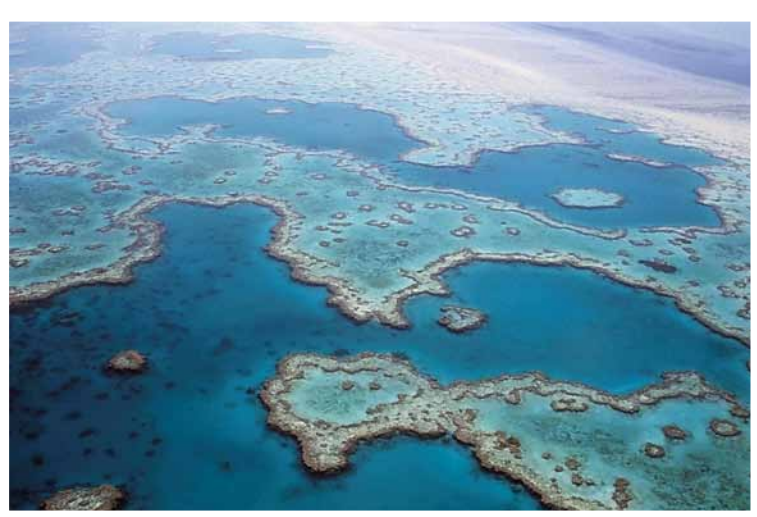
The Great Barrier Reef near Cairns, Queensland.

If you headed west from Victoria, you would arrive in South Australia. You are now in wine country. Enjoy the highest-rated Australian wine from the Barossa Valley, Penfold's Grange. I recommend experiencing animals in the wild on Kangaroo Island, which is a short flight from Adelaide, or find that perfect precious stone from