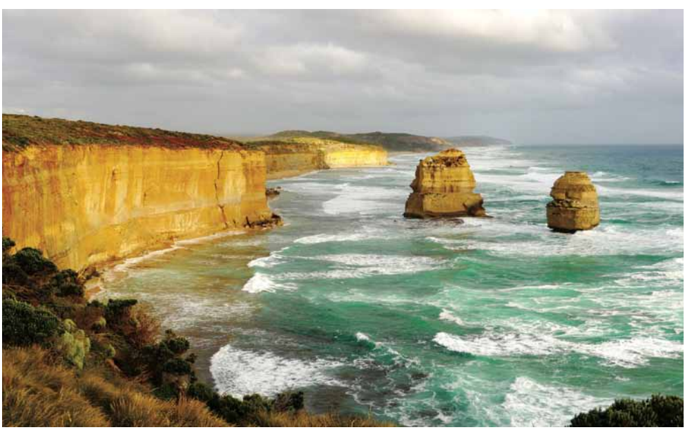
Victoria and the Great Ocean Road.

Our exploration will begin with New South Wales. Sydney with its iconic Harbor Bridge and Opera House is the perfect place to begin and end your time in Australia. It is the major events capital of the South Pacific, and the perfect beginning for exploring the Blue Mountains, Hunter Valley, and the Pacific Coastline up to Byron Bay. I strongly recommend climbing the Harbor Bridge for enjoying the 365-degree view of the city, harbor, and ocean. Later on, treat yourself to a fabulous dinner at the Park Hyatt which is located harbor-side for a view of the Opera House.