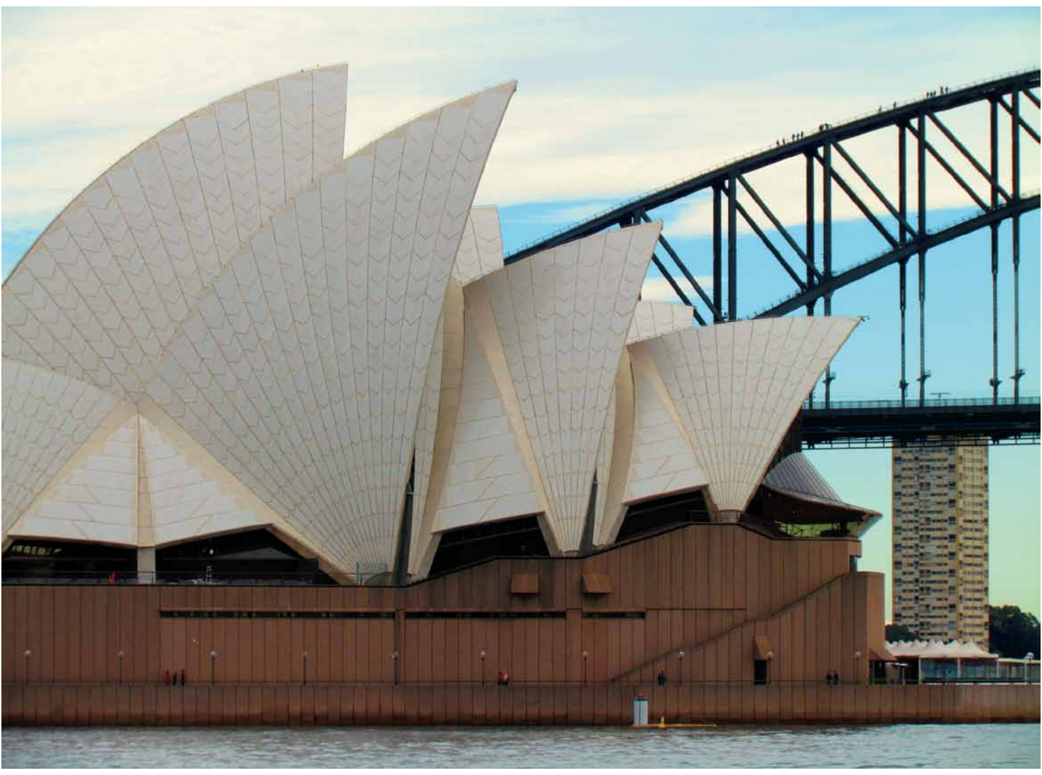
The new South Wales Sydney Harbor Bridge and Opera House.