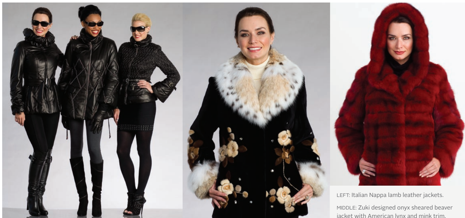
LEFT: Italian Nappa lamb leather jackets.