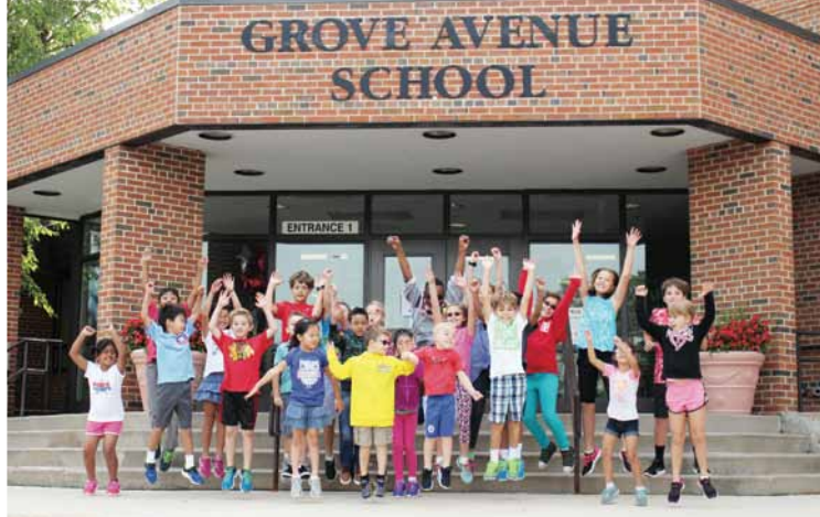
Grove Avenue Elementary School students celebrate.