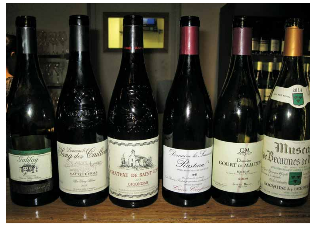
Wines tasted at Côteaux & Fourchettes restaurant later, at dinner.