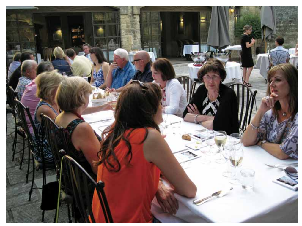
A dinner was held outside at Château de Rochegude.

After a short tour of the production facilities and cellar, we started the Château Pegaü degustation with the Côtes du Rhône 2014 Cuvée, which is produced from a recently acquired property. It was fresh, vibrant, and served well as the first wine of the day. It was followed by the more serious Châteauneuf-du-Pape Blanc Cuvée. This wine had heft and promised more sophistication with bottle age. Next came the YSIG Pink 2014 which was fairly typical of French rosés, plenty of fresh