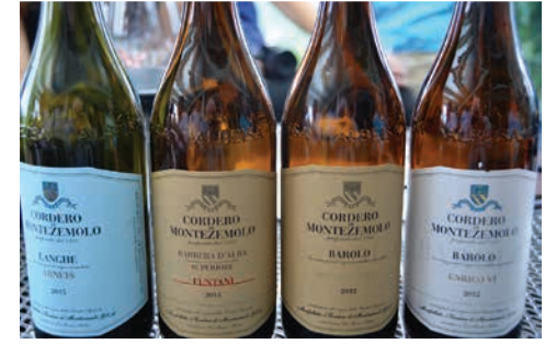
Wines sampled at Cordero di Montezemolo.

We began with the Cordero di Montezemolo Arneis which was fresh and thirst quenching in the warm weather. We had several wines which were all true to the respective grape characteristics, but I will focus on only two. These wines are special in many ways but principally because they represent the finest fruit from the vineyards and are only made in the highest quality vintages. Furthermore, they are limited to one thousand 1.5-liter bottles (magnums) and are sold only at the winery.