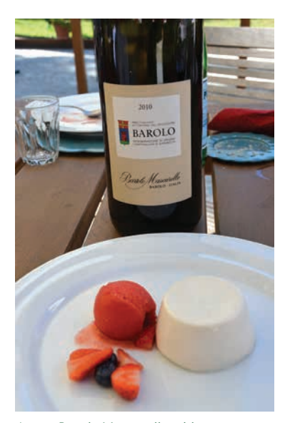
A 2010 Barolo Mascarello with panna cotta and fruit dessert.

This wine is similar to the 1998 version of the same wine but is bigger. This is a result of the more masculine vintage (2001), but both are typical of the vintage. The 2001 also has a confounding nose, but while the tannins are sweet and soft, they are in relative infancy versus the 1998. The nose was redolent of tar, tobacco, and rose petals and should be served with flavorful lamb or beef or accompanied by white truffles served on tagliatelle or risotto. This wine has a long 60-second aftertaste and will continue to mature for a de-