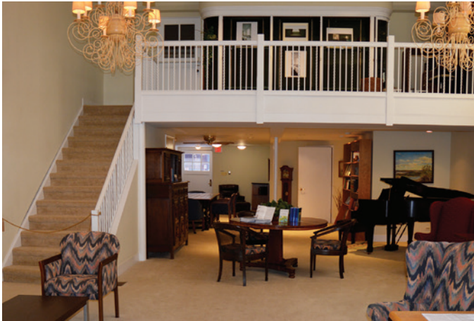
The space is inviting with seating areas and a piano for guests.