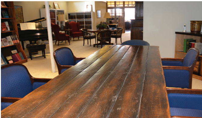
Guest can gather at this large table for meetings and book reviews.

Monitor, an international daily newspaper founded in 1908, by Eddy, “To injure no man but to bless all mankind.”