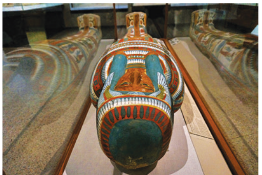
The coffin and mummy of Meresamun, an elite musician-priestess, c. 800 B.C.