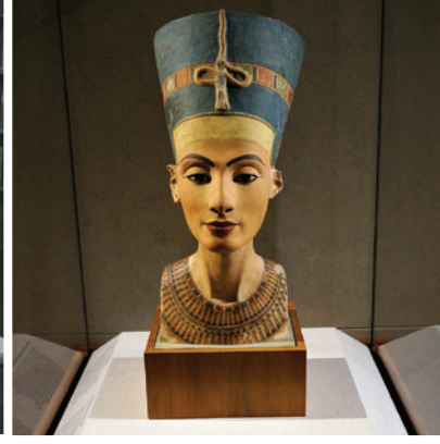
Bust of Queen Nefertiti, Egypt, 14th-century B.C.