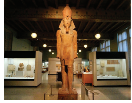
Statue of King Tut (Tutankhamun), Egypt, 14th-century B.C.