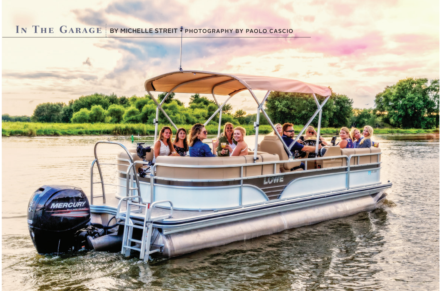
Barrington Boat Club offers all the enjoyment of boating without the hassles and added expenses.