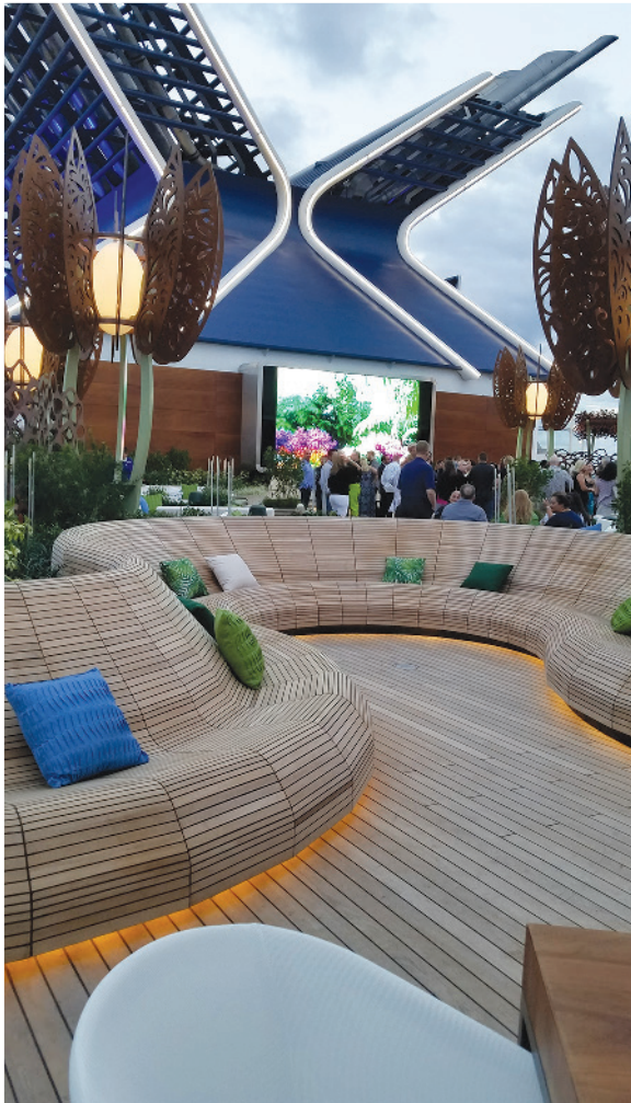
The Edge's Rooftop Garden Terrace featuring live greenery and live music give this space an outdoor garden effect.