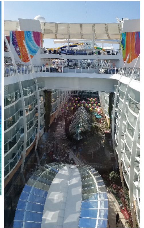
The Symphony Central Park neighborhood offers real trees, fresh lawns, and upscale dining.