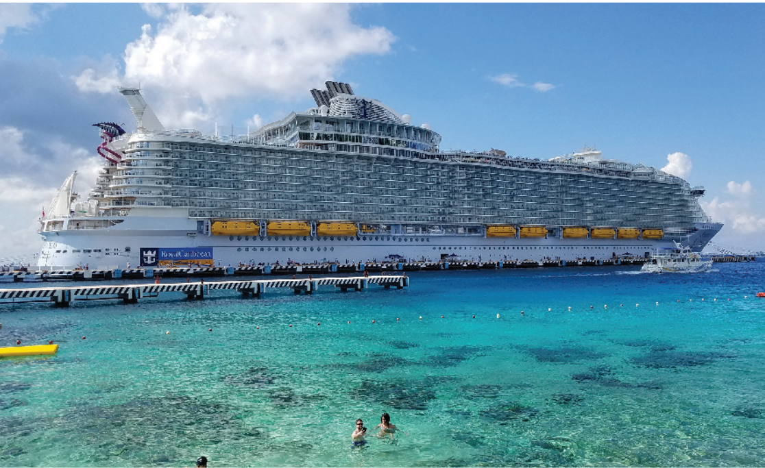
Symphony of the Seas: The largest cruise ship in the World.