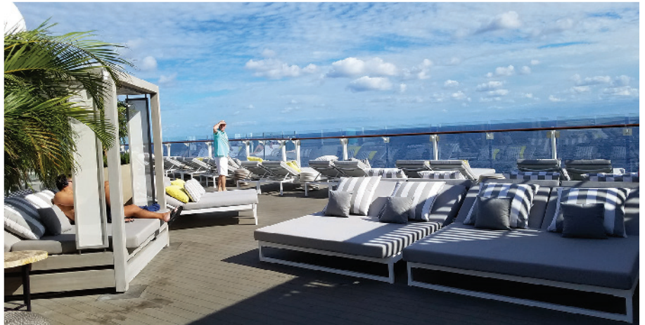
Some Suite categories offer direct entrance to the sun and pool space.