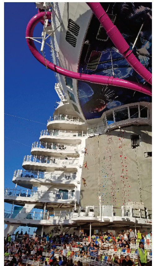
The highest water slides at sea are onboard the Symphony of the Seas.

Nighttime on-board brings on an array of entertainment options for the grownups, with the Latin fusion dance club Boleros, Contemporary dance venues, Comedy Central, Casino, and Broadway style productions such as “Grease”.