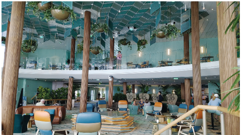
Eden venue on the Celebrity Edge offers a casual dining venue and unique entertainment.