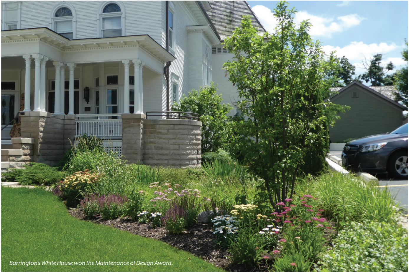
Barrington's White House won the Maintenance of Design Award.