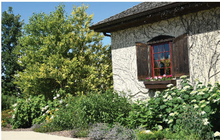
The Onion Pub was awarded for Integration of Native Materials.