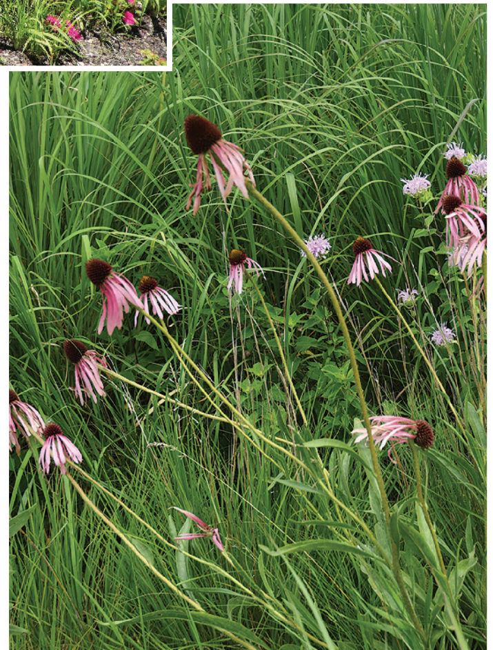
Citizens for Conservation received a Special Recognition Award.