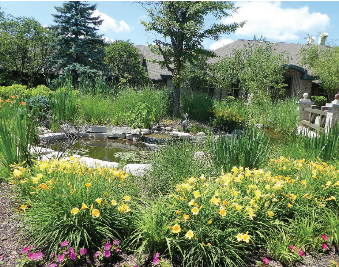
Alden Estates of Barrington won the Hardscapes Award.