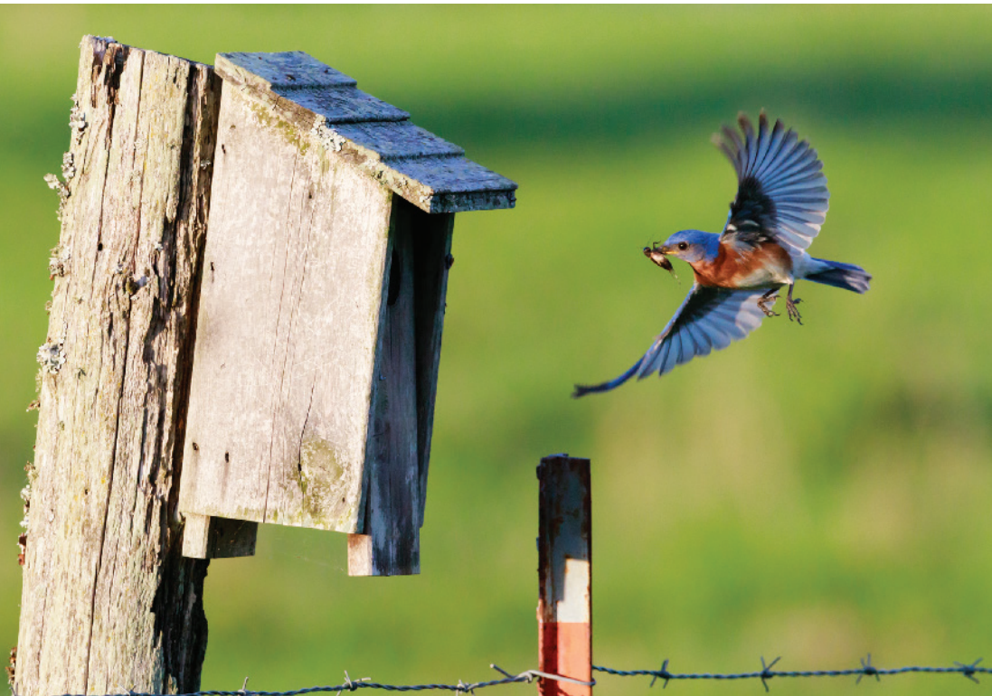
A bluebird nesting box.