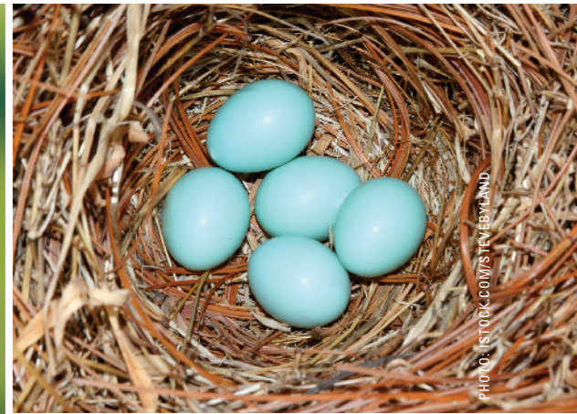
Eastern Bluebird eggs in a deep nest.