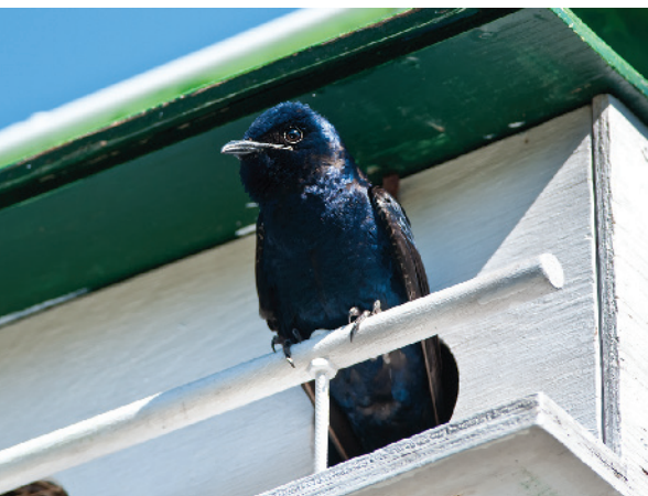
A Purple Martin perches on its nesting box.