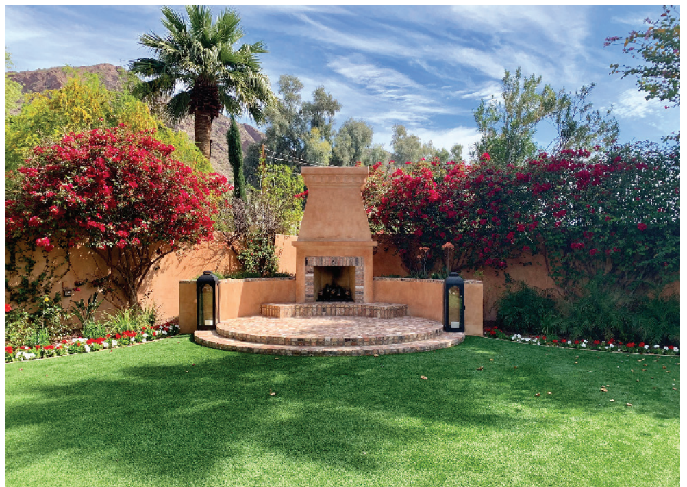
Camelback Vista at the Royal Palms Resort accommodating up to 160 guests.