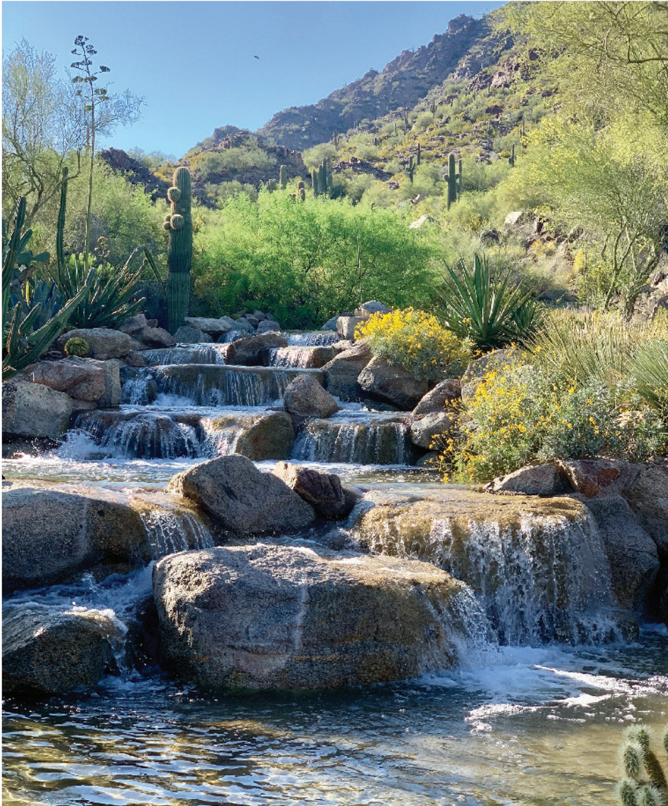
The gorgeous Canyon Suites reception venue at the Phoenician showcases Camelback Mountain.