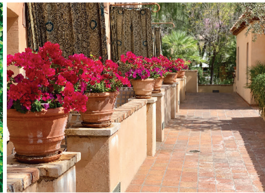
One of many Spanish-villa inspired pathways at the Royal Palms Resort.