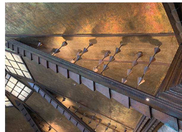
The gold-leaf ceiling in the Aztec Room at the Frank Lloyd Wright inspired Arizona Biltmore.

If an elegant affair is your desire, the Arizona Biltmore is your calling. Notable honeymoon guests of the property are Clark Gable and Carole Lombard and Ronald and Nancy Reagan.