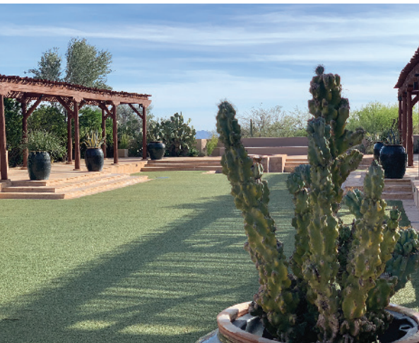
The Fountain Terrace at the Four Seasons Resort Scottsdale at Troon North.

Popular with locals and millennials, the bungalow accommodations include bright accents, complimentary in-room amenities (Banana Boat Sunscreen and Sunglasses), and Hermès toiletries. Give back by renting out the RED Cabana at the main pool for a day. Part of the $250 USD cabana fee is donated to the RED foundation, supporting the ongoing fight against AIDS.