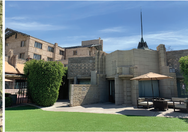
Frank Lloyd Wright inspired architecture at the Arizona Biltmore.

choice to host destination weddings. Whether the celebration calls for black-tie formal or boho-chic, Scottsdale's Sonoran paradise has it all, especially when it comes to exciting resort wedding venues. The Best of the Best for 2019 all offer uniquely refreshing takes on personalized service, complete with customizable wedding packages and tireless attention to detail meant to enchant the happy couple and all in attendance. Here are few of the best for 2019.