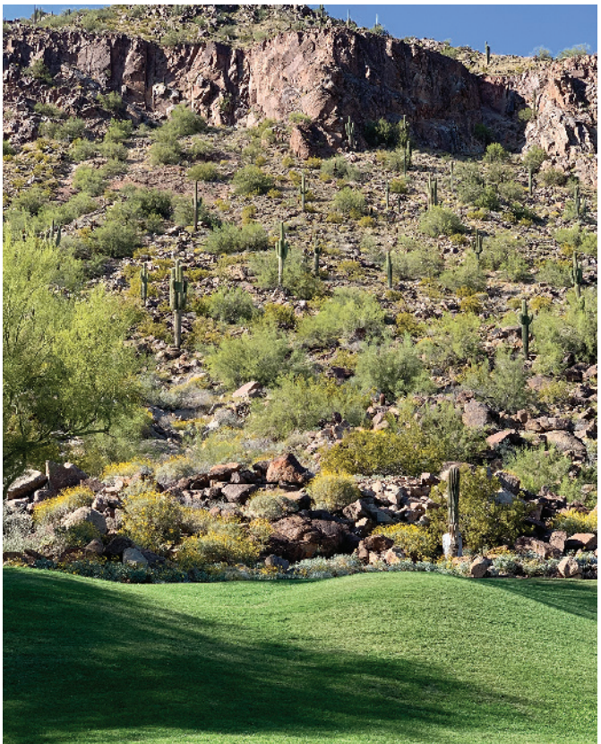
The Canyon Lawn at the base of Camelback Mountain.