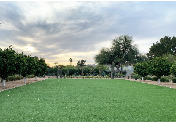
Peaceful Cholla Lawn at sunset at the Andaz. Rent out 'The Retreat' space (16 rooms, one three-bedroom home) for your wedding guests, complete with private pool for your party to enjoy. The dog-friendly resort offers complimentary drive-up parking next to the guest bungalows.