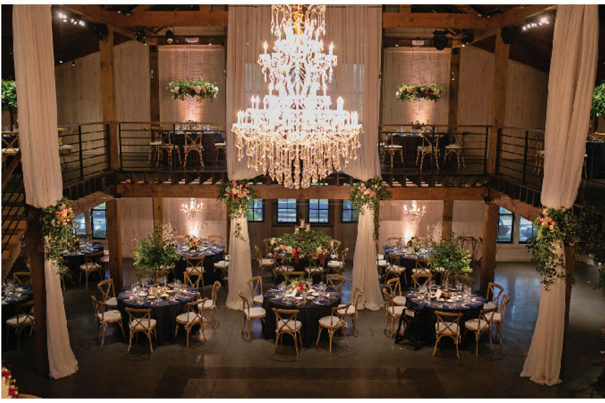
The couple's 170 guests fit comfortably in the reception barn.