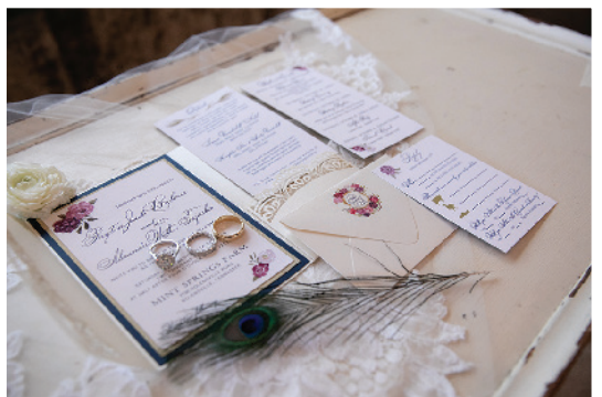
The floral designs were created by the groom's