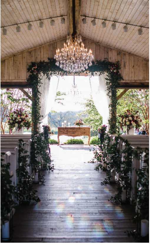
The ceremony pavilion at Mint Springs Farm.