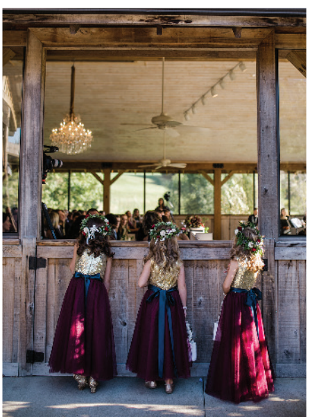
The flower girls eagerly await the ceremony.