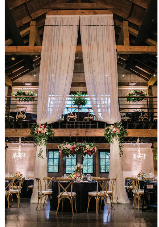
Fresh and modern décor accents the rustic venue.