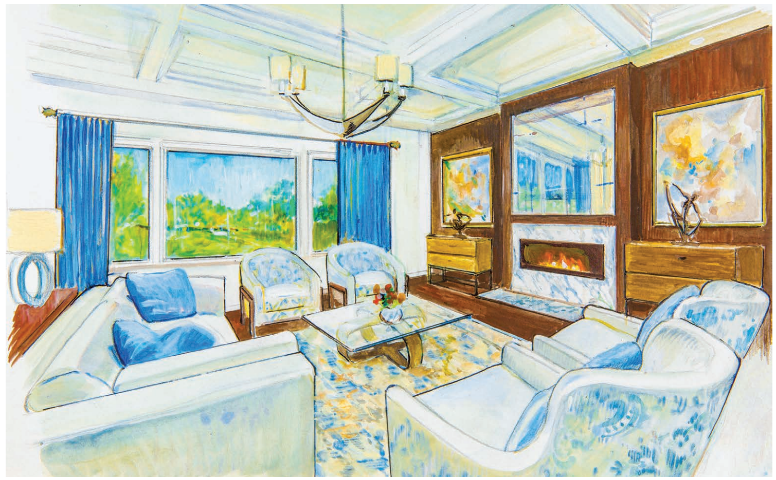
Inspired by the open-floor plan and the warm blue tones of the custom kitchen backsplash by Artisan Stone Tile, Kedra Chalen Design created this comfortable, modern yet classic family room as an extension of the kitchen. The DaVinci custom linear fireplace with marble surround is the true centerpiece of the room. Enhanced by classic moldings and trim, coffered ceiling and wood paneling, the room offers warmth and dimension through these decorative elements including an antique area rug from Organic Looms which anchors the space, creating a welcoming environment for the whole family to enjoy.