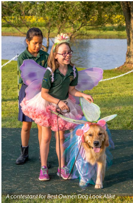
A contestant for Best Owner/Dog Look Alike