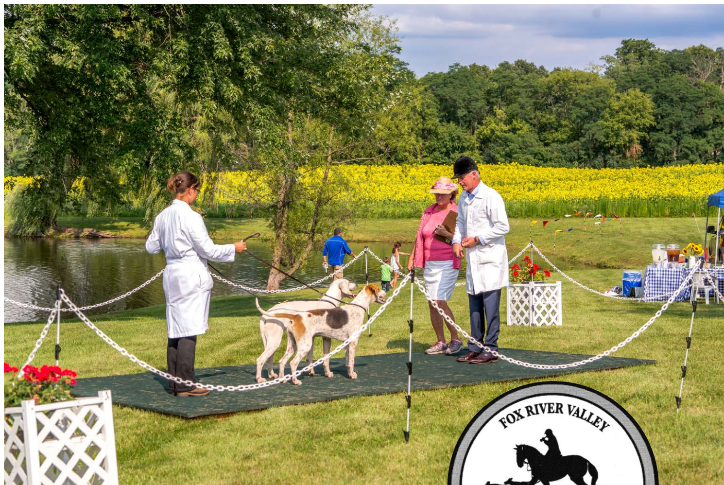
A judge reviews the hounds.