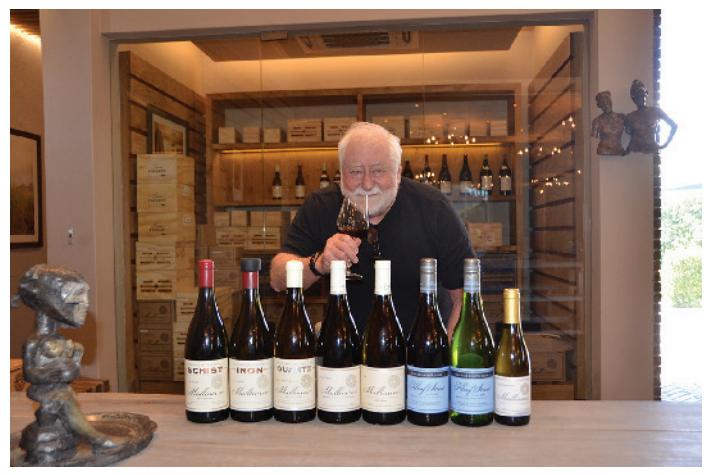
Here are the wines tasted on the trip.

bly my most impressive wines of the trip and this from a person who does not much appreciate Chenin Blanc except for those from Savennières (especially Baumard, Le Papillon) in the Loire Valley. The most impressive Syrah was the "Iron" designation and it was beautifully made. It has a rich mouthfeel with intense minerality. These wines were purchased by our group and enjoyed on the two-week subsequent Crystal Symphony cruise on the Indian Ocean. Mullineux wines have limited distribution in the United States and must be ordered direct from the winery.