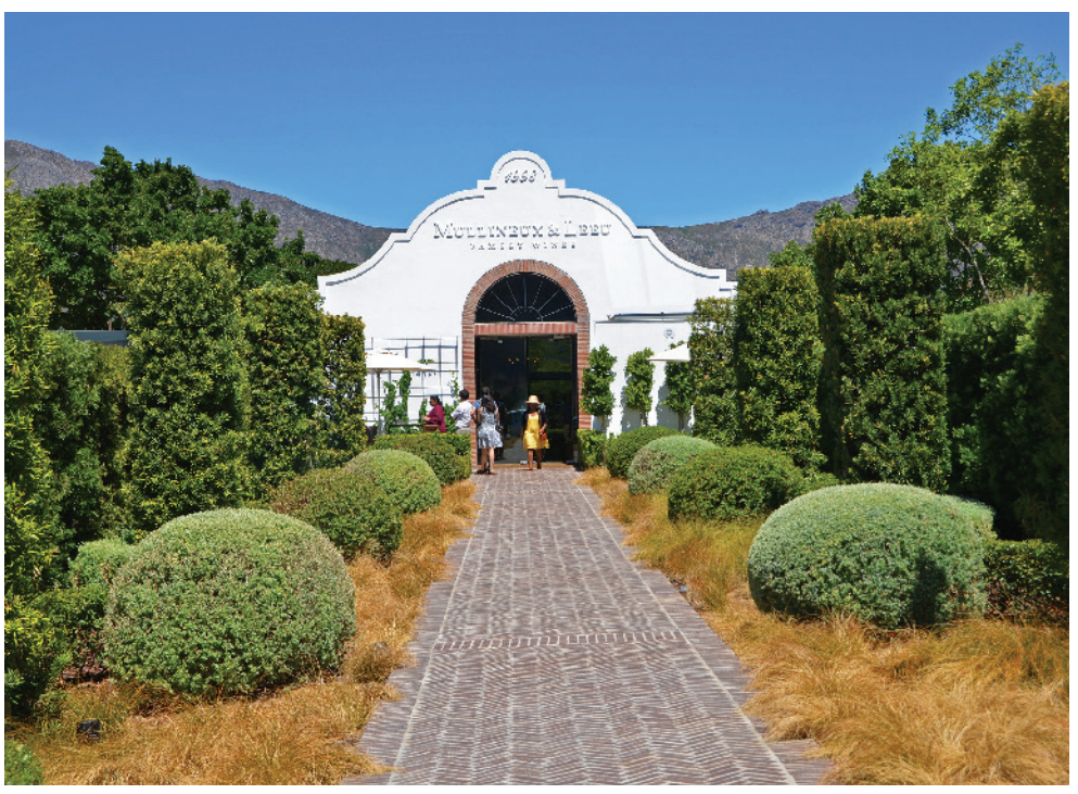
The Mullineux & Leeu Family Winery

While all the wines were impressive, we were particularly impressed by the Chenin Blancs and Syrahs. My favorite Chenin Blanc was the "Quartz" designation although all were very good, followed closely by the "Granite" designation. Both wines were intense with a great mouthfeel from the minerality of the soil. They were proba-