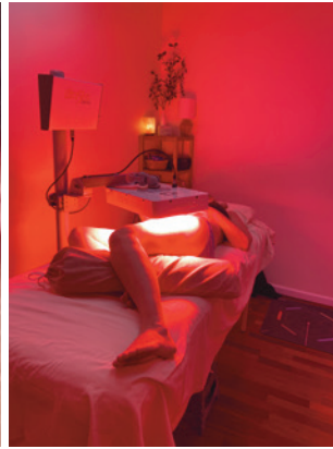
Red Light Therapy is FDA-Cleared.