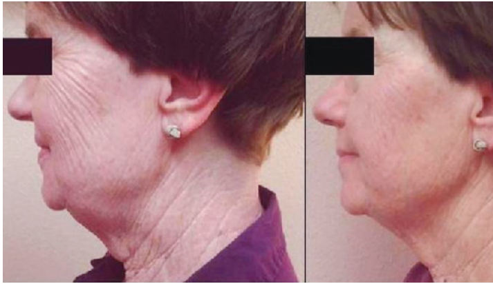
Red Light Therapy can improve facial texture.