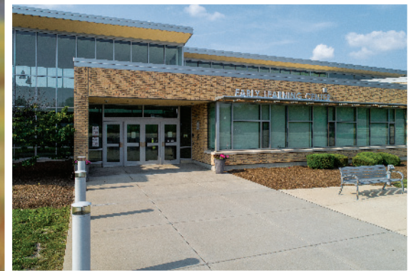
District 220 Early Learning Center