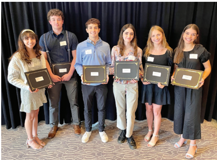
Congratulations to the 2022 Lauren Brown Memorial Scholarship recipients.

APPLICATIONS FOR THE 2023 Lauren Brown Memorial Scholarship are now available from the Barrington Area Chamber of Commerce (BACC) at BarringtonChamber.com , or through the Chamber office located at 190