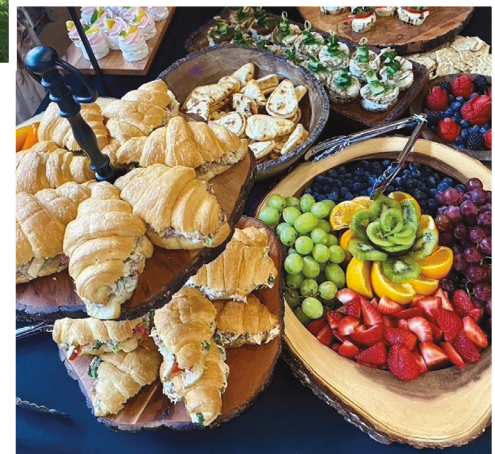
Food from the Cold Blooded Smokehouse & Catering.