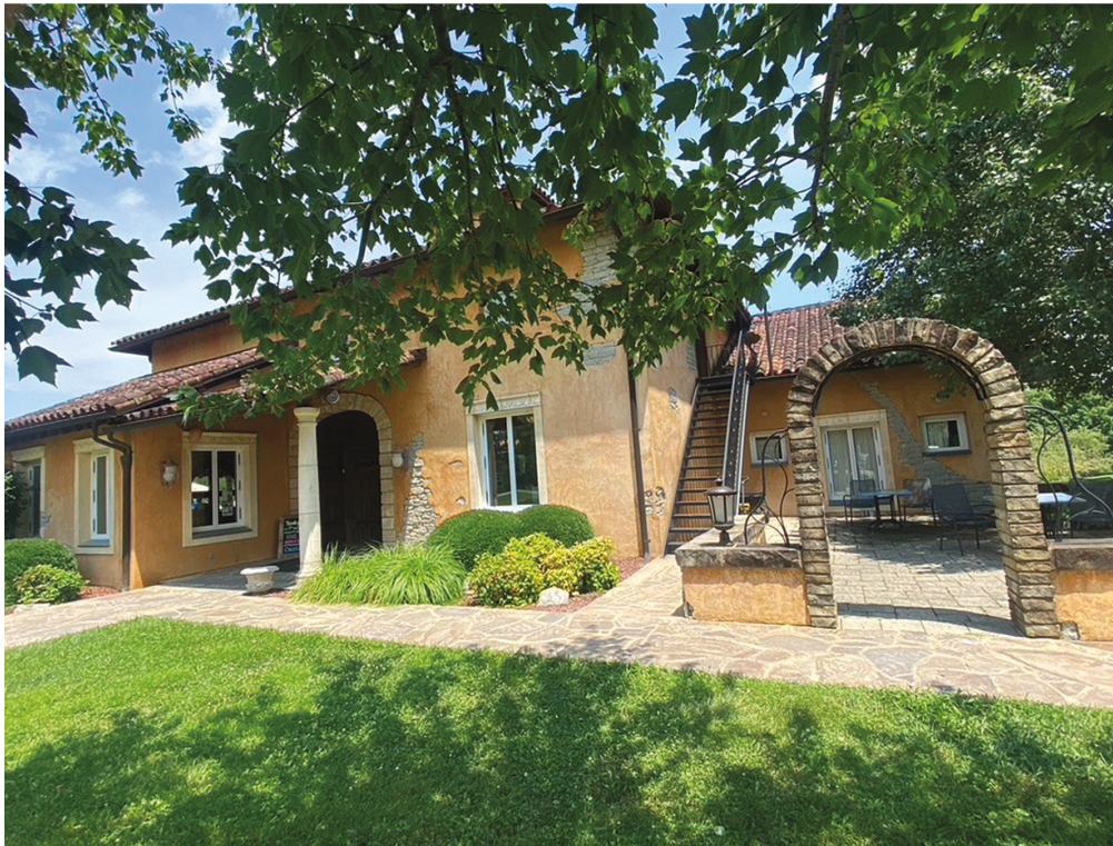
Tuscan-inspired Blue Sky Vineyard in Makanda.