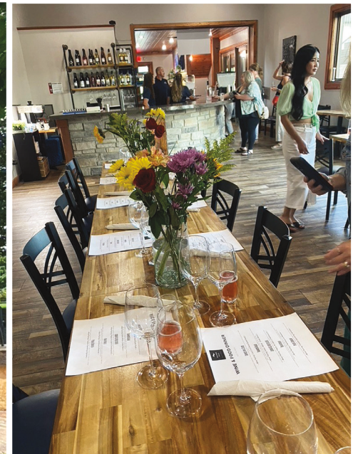
The table is set for a feast at Feather Hills Vineyard in Cobden.