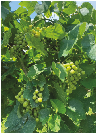
Fruit of the vine in July at Blue Sky Vineyards.