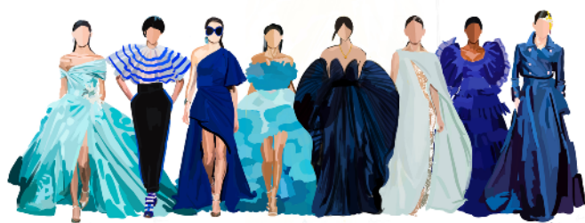
ILLUSTRATION SERVICES INCLUDE

WEDDING PORTRAITS PET PORTRAITS FAMILY PORTRAITS CUSTOM ARTWORK STATIONARY ARTWORK COFFEE MUGS APPAREL WRAPPING PAPER CUSTOM WALL PAPER PHONE CASES AND MORE