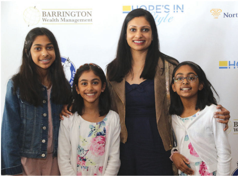
Barrington 220 students and their mom attend Hope's in Style 2020.