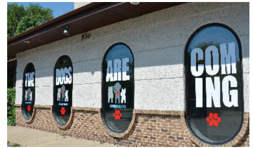
The building to be renovated is in Palatine on N. Smith Street.