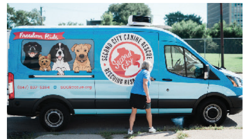
Second City Canine Rescue serves Chicagoland.