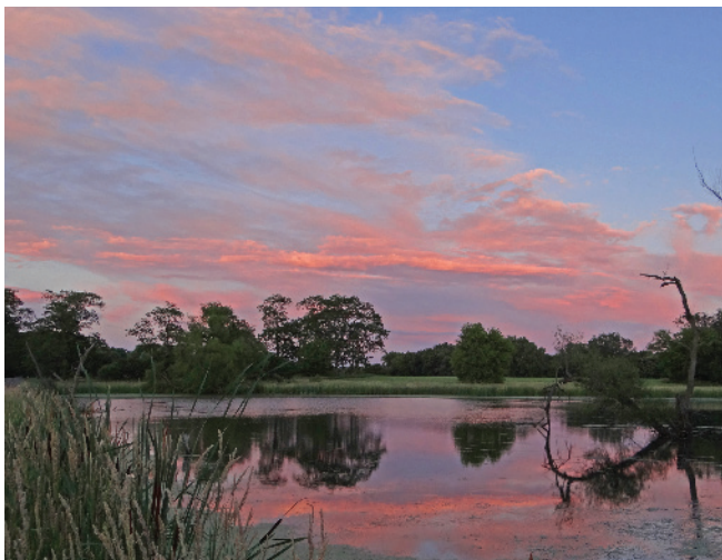
Clouds all pretty in pink.

B arrington Hills Farm, located principally between Haegers Bend Road on the west and Spring Creek and Chapel Roads on the south and north consists of a diverse acreage. Approximately 420 acres are planted with various crops this year with the remainder being oak woodlands and wetlands. The wetlands are primarily marsh areas, some adjoin, some are isolated.