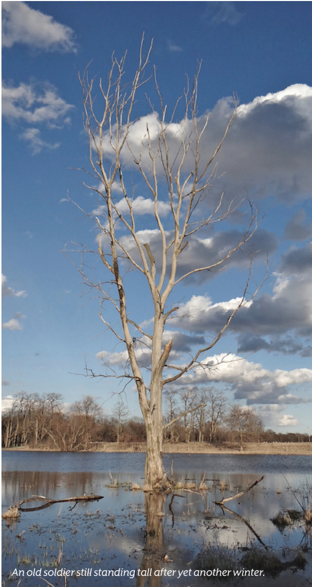
An old soldier still standing tall after yet another winter.