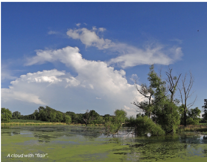
A cloud with "flair".