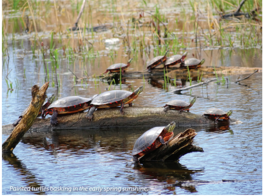
Painted turtles basking in the early spring sunshine.