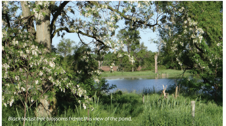
Black locust tree blossoms frame this view of the pond.