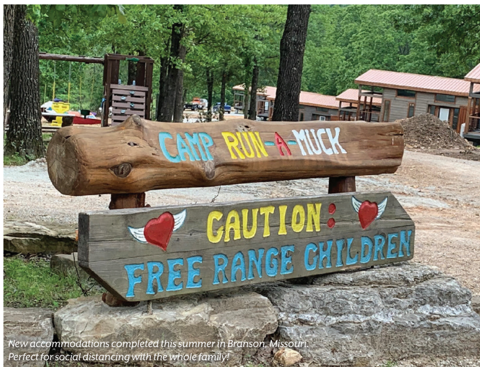
New accommodations completed this summer in Branson, Missouri. Perfect for social distancing with the whole family!

Road-Trip Tip Three: Be aware of your surroundings while on your trip. Is resort staff wearing masks and gloves? Does housekeeping change gloves between room cleanings? What is the occupancy rate at the hotel like? If visiting a rental property, ask when the last guests checked out. Any question that gauges your chance of potential exposure is a great question to ask!