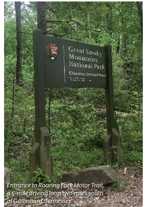
Entrance to Roaring Fork Motor Trail, a 5-mile driving loop two miles south of Gatlinburg, Tennessee.