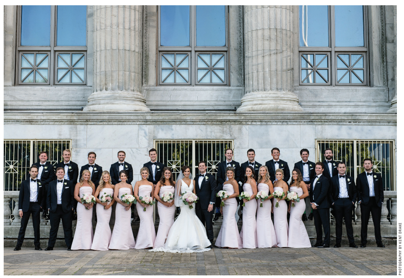
Opposite page: The newlyweds headed down to Lake Michigan for photos. Above: The wedding party included the couple's closest friends and family.