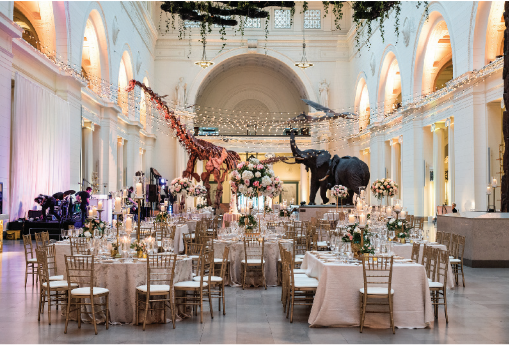
The 250 guests from across the country were greeted by the Field's iconic African elephants and dinosaurs.