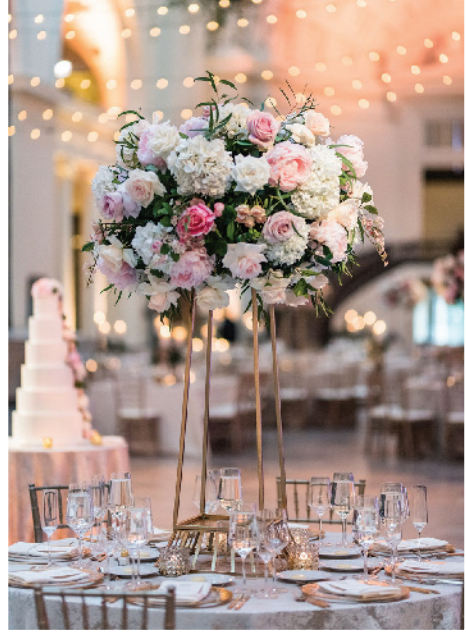
Blush florals by Kehoe Designs filled the room

After a fantastic meal from Food For Thought, and several speeches that brought a lot of tears and a lot of laughs, we began dancing the night away.