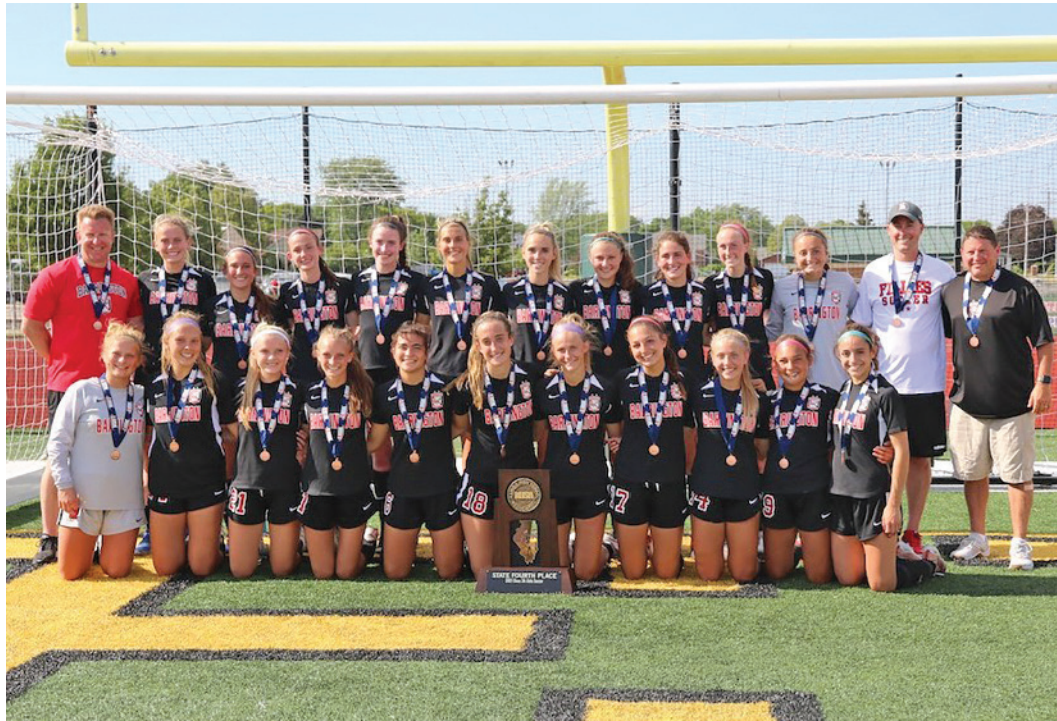
Congratulations to Barrington Girls Soccer Fillies team, Fillies coaches, and families for your Fourth Place State win!