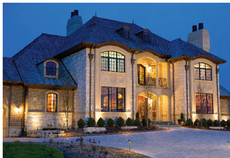
A Homes By Pinnacle dream home.