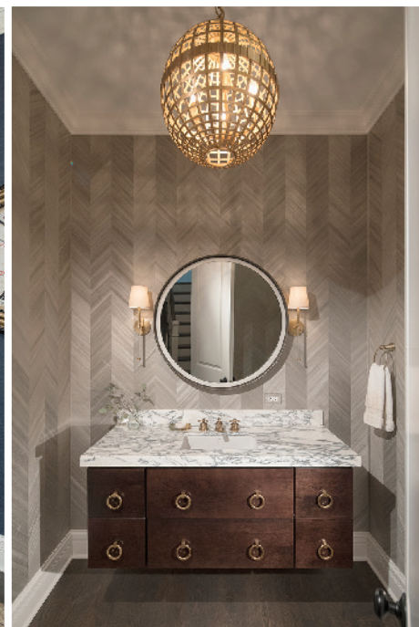
This powder room features a floating vanity.

budget. If you need assistance from your financial advisor, reach out to him or her and have a discussion that clearly sets a budget you feel comfortable with. Once you've done your due diligence and have completed these goals, you're now ready to find your design team.