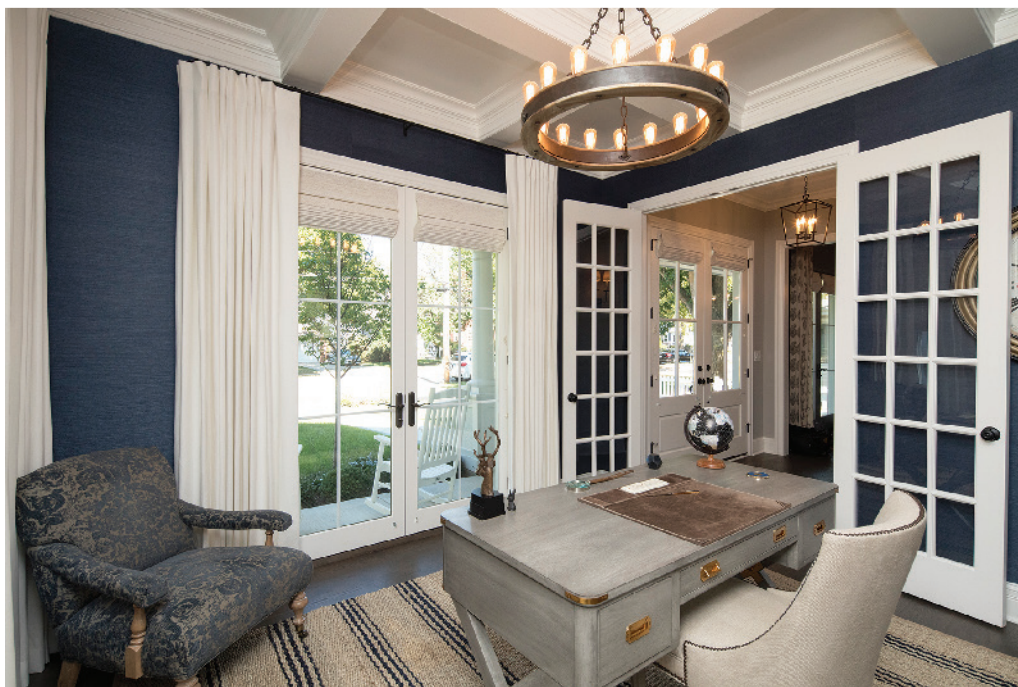
The home office for work or as sanctuary space.