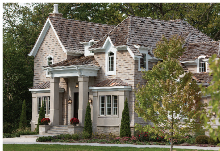
A beautiful exterior offers a warm welcome.