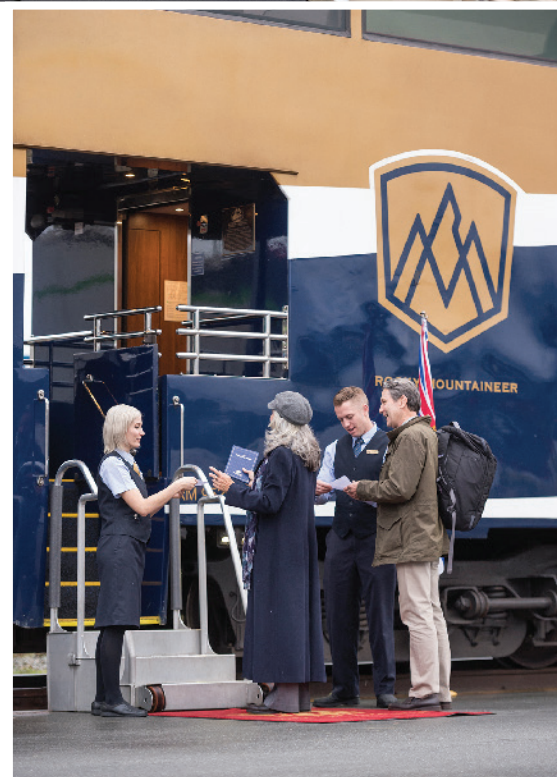
Train travel is well-organized by Rocky Mountaineer staff.

The "Rockies to the Red Rocks" tour takes you on a seven-night journey through Utah and Colorado's extraordinary landscapes. Vast canyons, inspiring deserts, natural archways, and enchanting hoodoos—tall, thin rock spires—are just a start. Along with five days of land touring by deluxe motorcoach, the Rocky Mountaineer train portion includes two days of highlights best or only seen by rail, all done in the daylight (you do not sleep on the train).