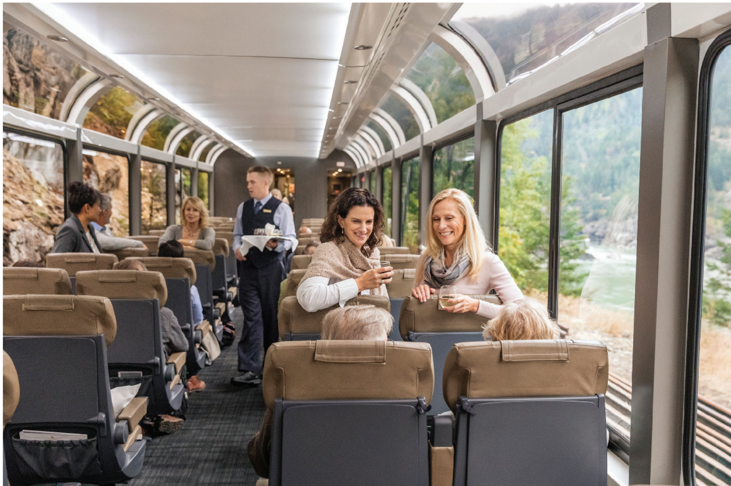
Rocky Mountaineer Rail tours offers luxury travel with overnight accommodations at 4- and 5-star hotels.