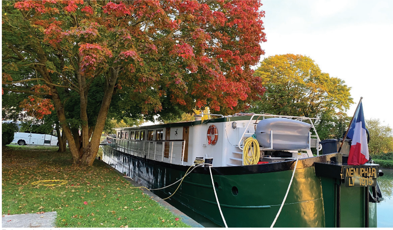
The last mooring site for the group's cruise on the canals of Champagne.