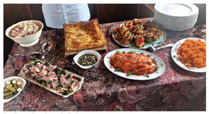
A collage of lunch meal offerings.

The experience on the barge was very different from the full day and evening calendar we had in Bordeaux. The barge was very well appointed, and the itinerary permited more leisure time. In fact, we visited only two Champagne houses. Both were unknown to any of us, but we were very impressed with their range of Champagnes.