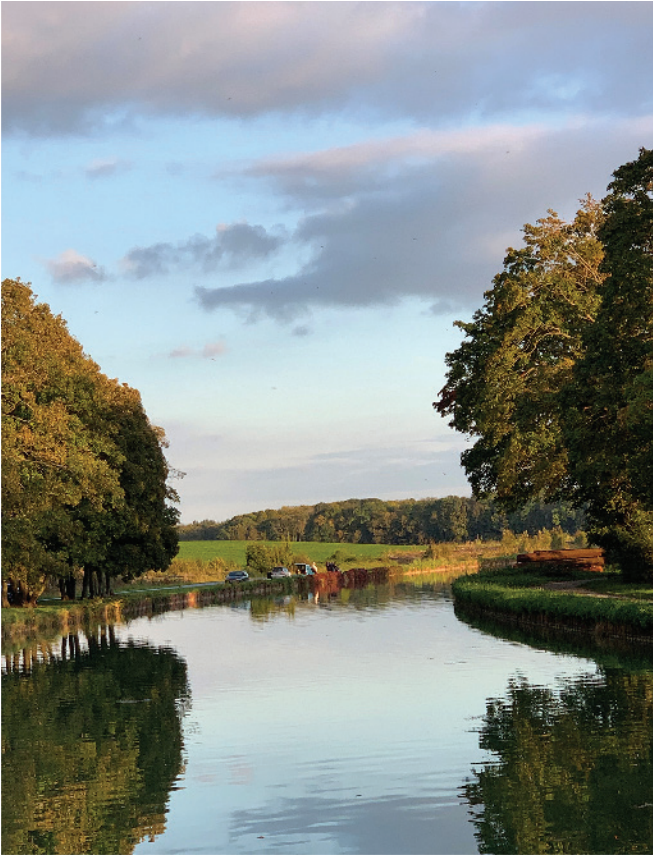
The beautiful countryside of Champagne.