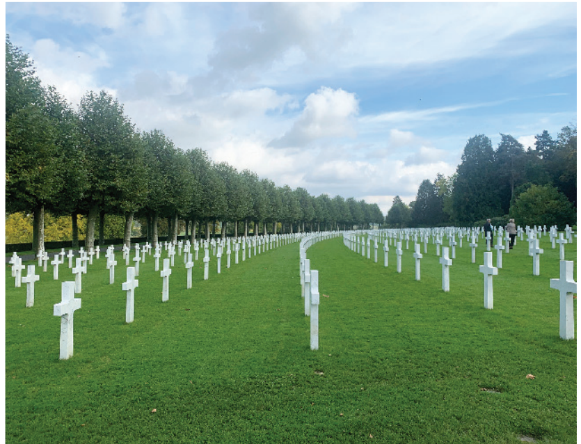
The Aisne-Marne American Cemetery is located at Belleau Wood.