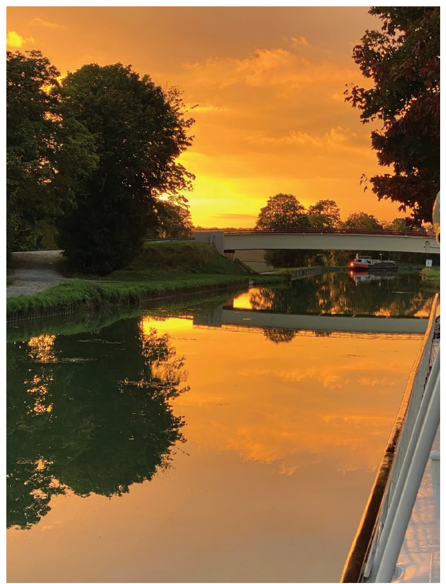
A morning view of the canal.