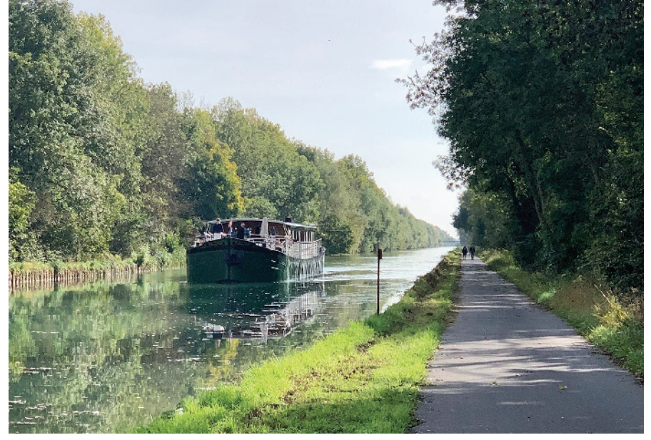
The barge arrives to pick up Jim Bryant after a bike ride along the canal.