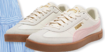
PUMA DSW.com, $70