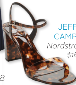
JEFFREY CAMPBELL Nordstrom.com, $164