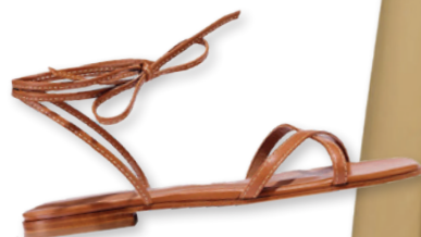
MARGAUX Margauxny.com, $275