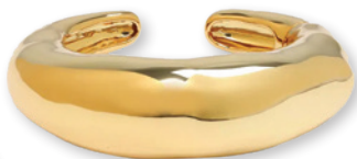
ALEXIS BITTAR Neimanmarcus.com, $275