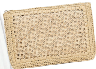
CATERINA BERTINI Shopbop.com, $136