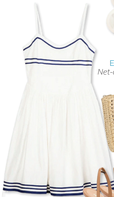
CIAO LUCIA Ciaolucia.com, $330