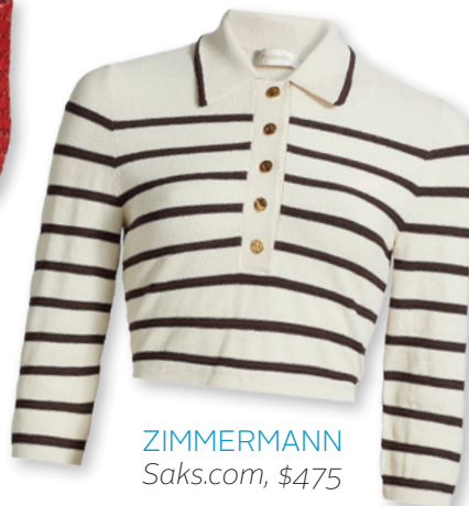
ZIMMERMANN Saks.com, $475