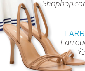
LARROUDÉ Larroude.com, $315