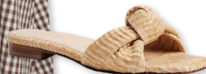
TUCKERNUCK Thuck.com, $185