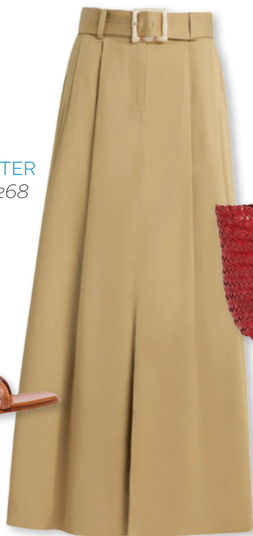
FAVORITE DAUGHTER Nordstrom.com, $268