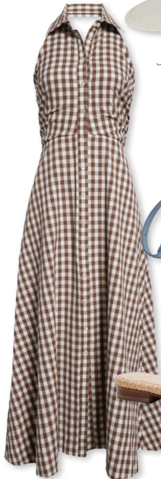
VERONICA BEARD Nordstrom.com, $598