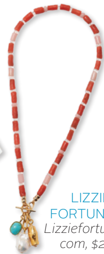
LIZZIE FORTUNATO Lizziefortunato.com, $295