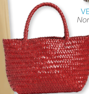
MADEWELL Shopbop.com, $138