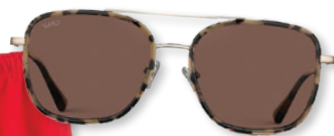
WEARME Amazon.com, $45