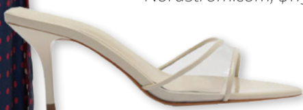
SCHUTZ Schutz-shoes.com, $138