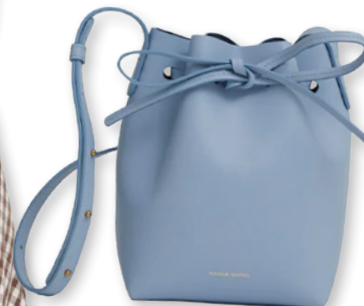
MANSUR GAVRIEL Mansurgavriel.com, $495