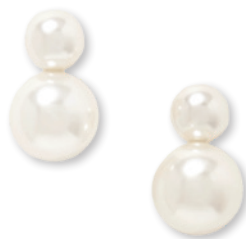
ENNIFER BEHR Net-a-porter.com, $170