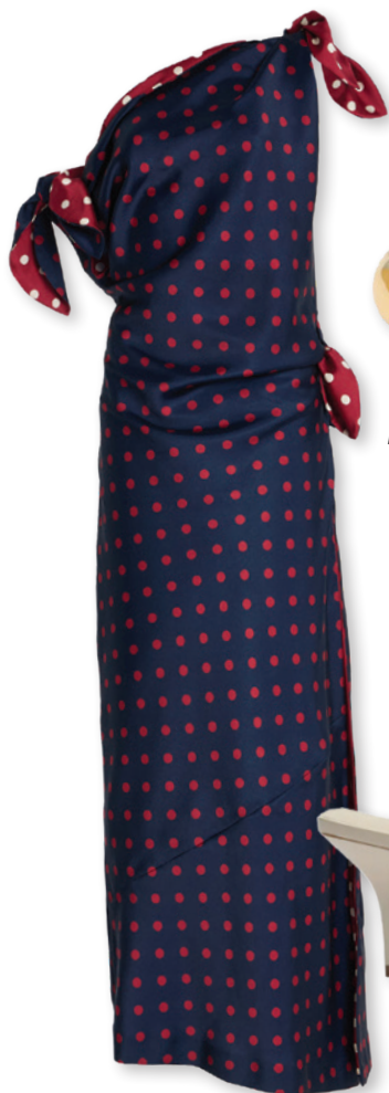
MARINA MOSCONE Modaoperandi.com, $1,250

A nod to coastal American style is classic for any summer wardrobe. The best part is that these pieces can come out to celebrate the season year after year.