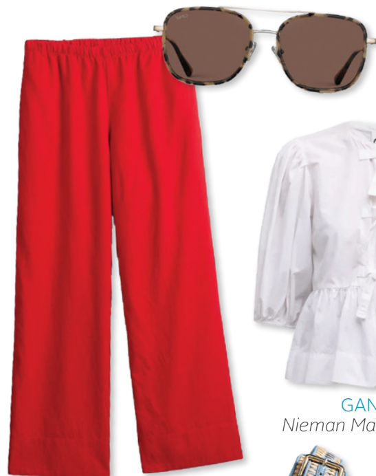
GAP Gap.com, $80