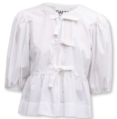
GANNI Niman Marcus, $215