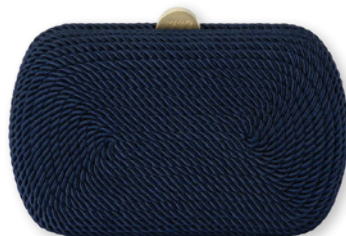
OLGA BERG Nordstrom.com, $115