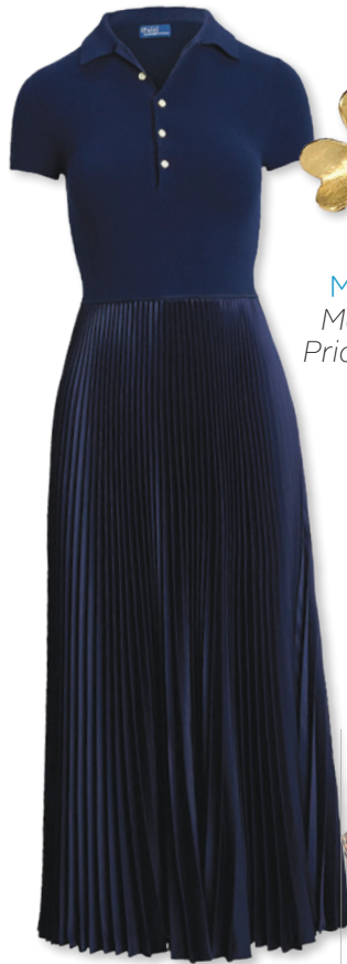
RALPH LAUREN Ralphlauren.com, $398