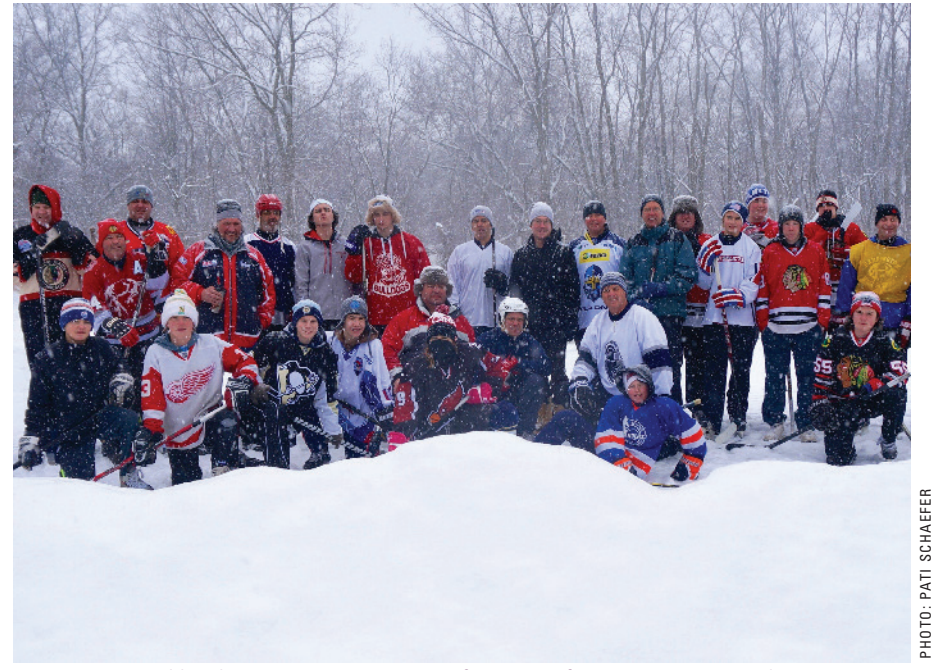
Pond hockey tournaments are a fun part of winter in Tower Lakes.