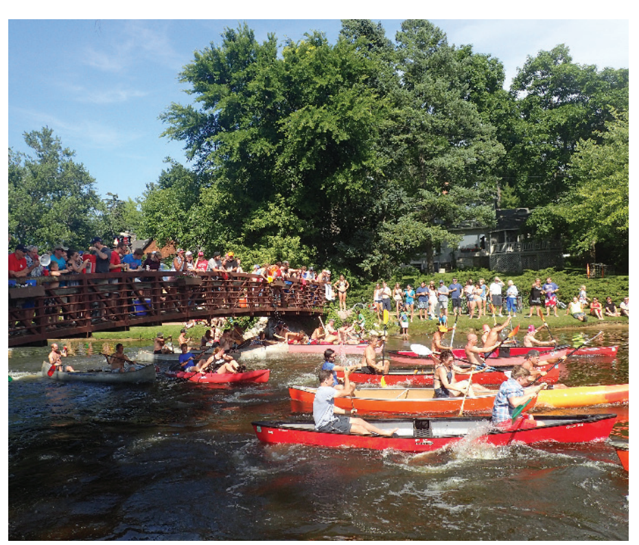
Boat races around the island cap off every Fourth of July.

Wauconda Station Manager of the short-lived Palatine, Lake Zurich, and Wauconda Railroad was hired to sell lakefront lots for summer cottages. They all hoped the resort development, named Tower Lake Park, would bring business to the failing railroad of which they were all directors. With the addition of a 68 ft. steel observation tower on the highest hill on the west shore, the Village of Tower Lakes had its beginnings.