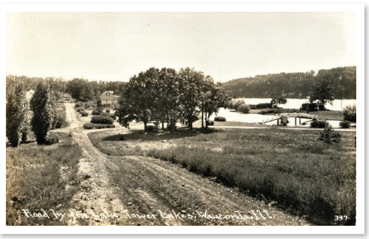
Terrace Drive and East Lake Shore Drive in the 1930s.

In northern Illinois, surveys were completed by 1839 and the Government Land Office opened in Chicago in 1840. Already the intrepid and brave, the seekers of fortune and better lives had begun their westward journeys, overland by wagon and ox cart, by water through the Great Lakes, into relatively unknown territory.