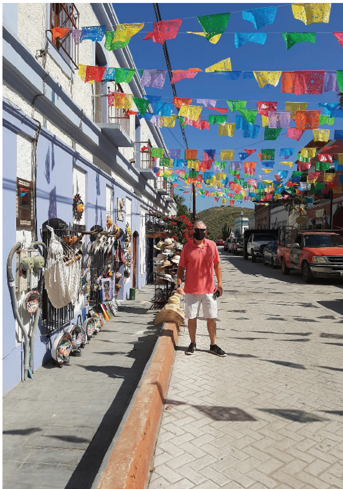
A traveler in Los Cabos.