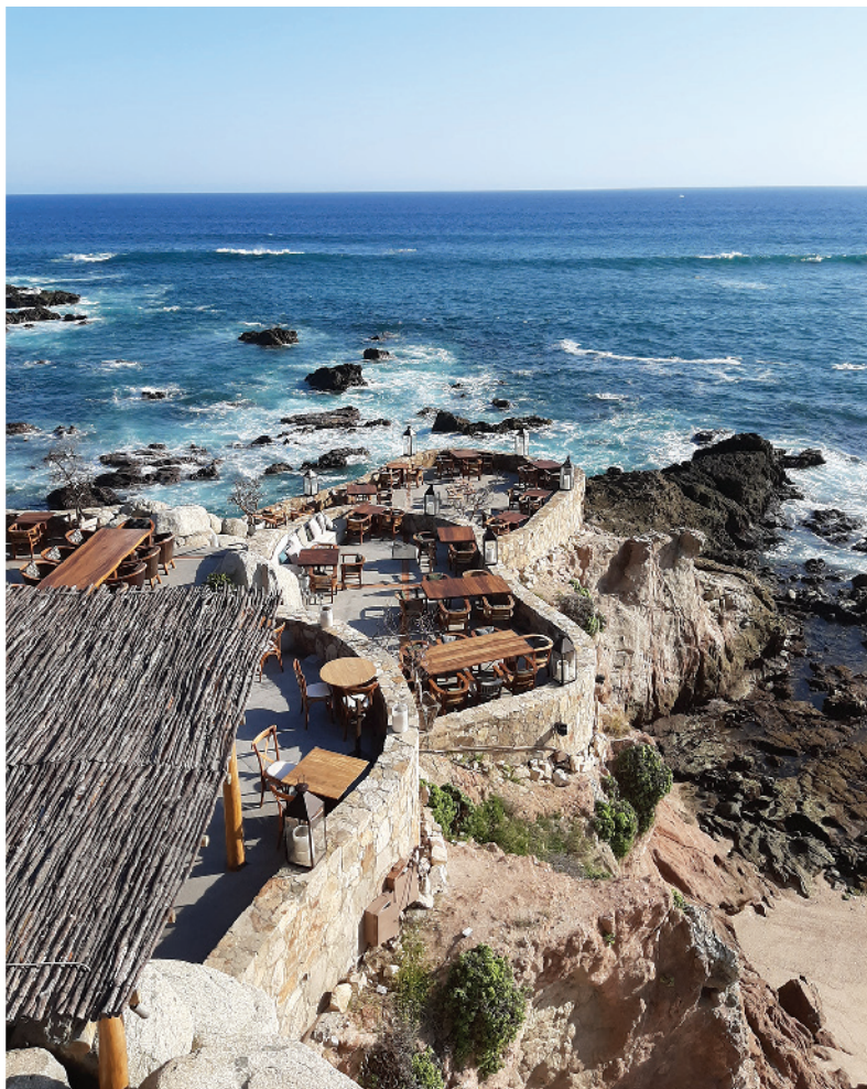
Cliffside dining at the Cocina del Mar restaurant at the Esperanza resort in Los Cabos, Mexico.

Should you become ill while traveling, your travel advisor will be an invaluable resource and liaison with your travel insurance carrier, medical assistance, and any change in travel arrangements you may need to make.