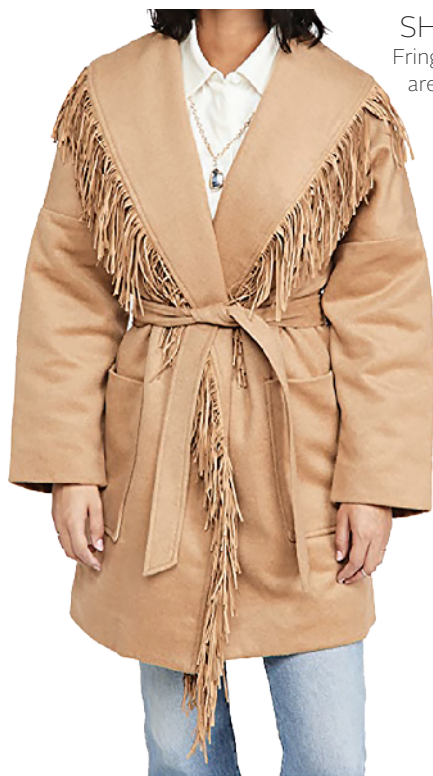
SHAWL COLLAR FRINGE COAT Fringed and Western styles mixed with classics are very 2021, like this Yellowstone-inspired Divine Heritage coat. ShopBop.com