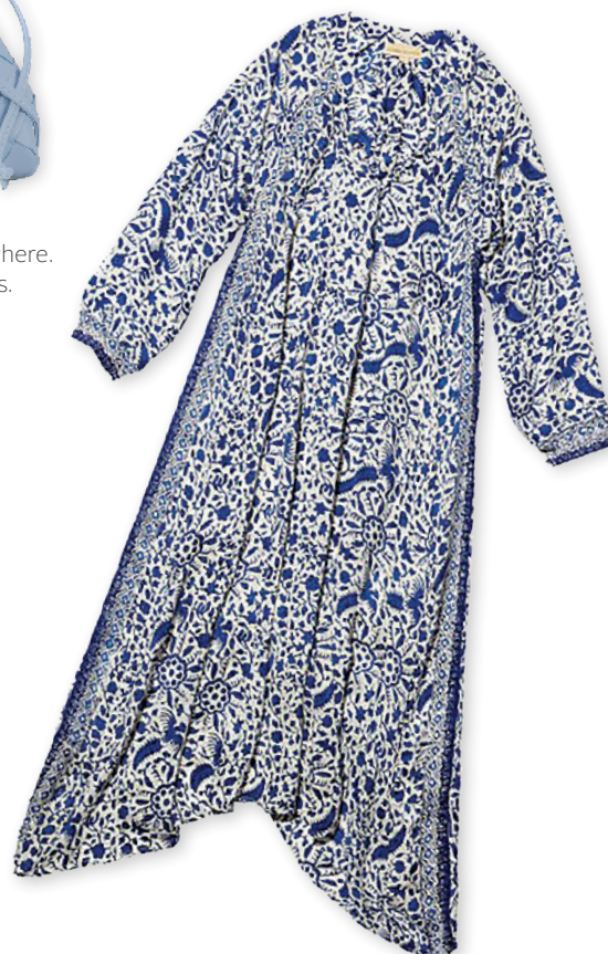
NATALIE MARTIN COLLECTION DRESS House dresses are the new sweat-suits and this silky one is the best. NatalieMartinCollection.com