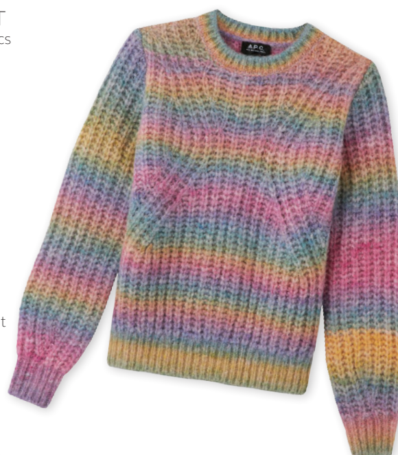
A.P.C. MARIANNE SWEATER Soft knits in pastels are a bright spot in the cold, gray winter. Shopbop.com