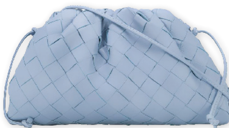
THE MINI POUCH Light blue accessories are popping up everywhere. From bags to scarves, shoes to headbands. BottegaVeneta.com