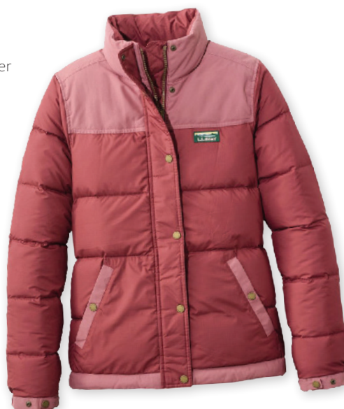
WOMEN'S MOUNTAIN CLASSIC DOWN JACKET That puffer you begged your Mom for in middle school is back and cozier than ever. LLBean.com