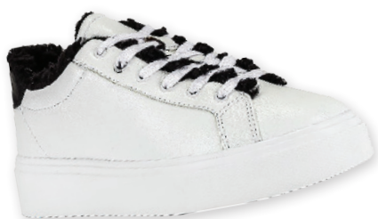
KRISTIN LEATHER SNEAKERS Shearling and faux fur are everywhere, even for the beloved sneaker you can wear with anything. Schutz-Shoes.com