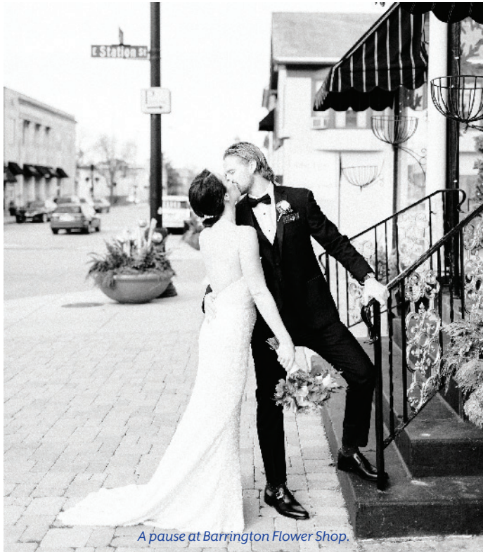
A pause at Barrington Flower Shop.