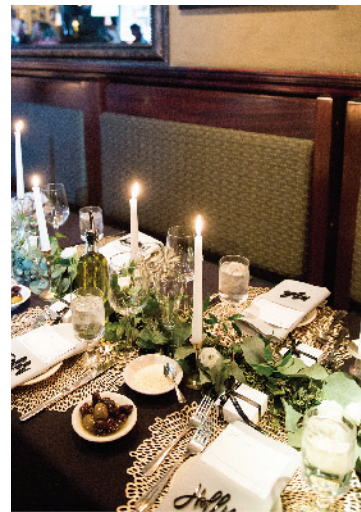
ZaZa's Tavola hosted the reception.