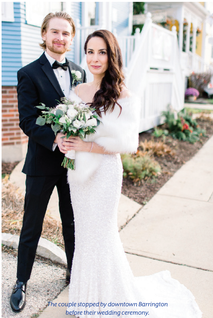
The couple stopped by downtown Barrington before their wedding ceremony.