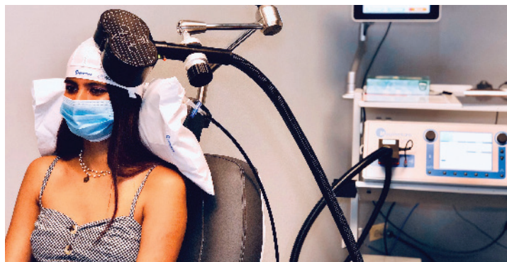
TMS Therapy Can Be Tailored to Each Patient's Unique Needs

We strive to provide the highest quality of care to help patients make positive changes in their lives. We value, respect, and embrace the uniqueness of all individuals. Our goal is to merge different treatment plans and customize individual approaches according to each patient's needs.