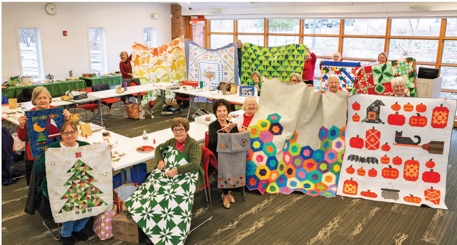
Members of the Circle of Friends Quilting Group showcase their beautiful quilt patterns in a large meeting room off the main entrance at Barrington Area Library.

ON ANY GIVEN DAY IN BARRINGTON, you could discover new books and films, have a fun play date with your children (or grandchildren), use a 3D printer and laser etcher, enjoy a live jazz or folk concert, find seeds for your veggie garden, and make an audiovisual presentation to your club or committee. The surprising part? You can do all those things, and much more, in one place: the Barrington Area Library.