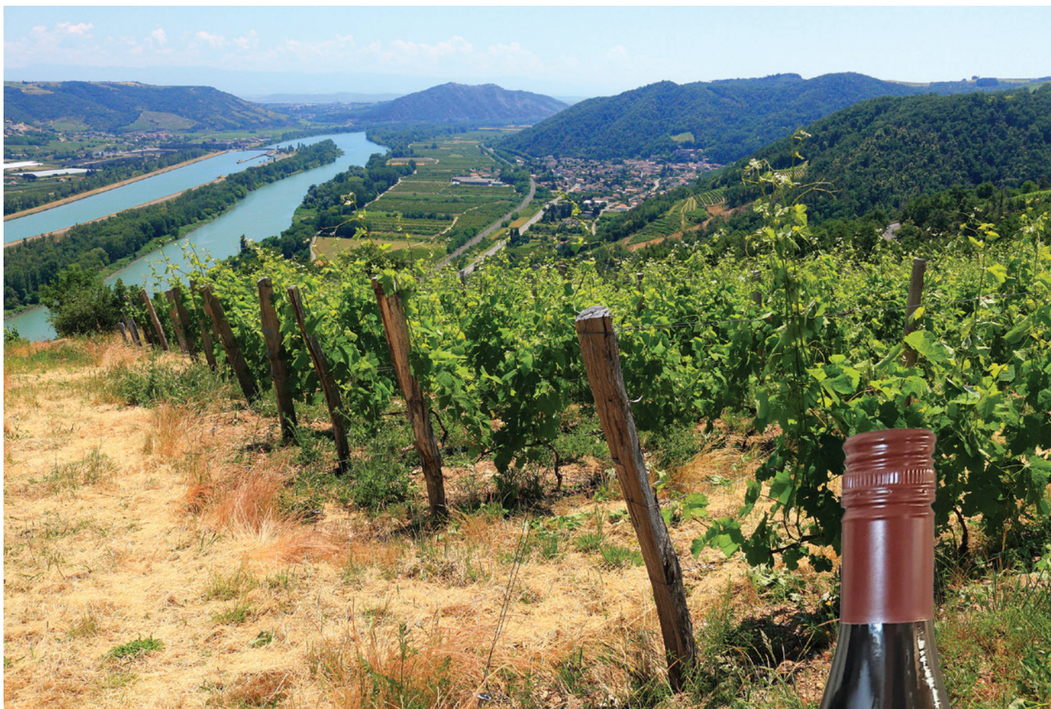
The Rhône River Valley in France.