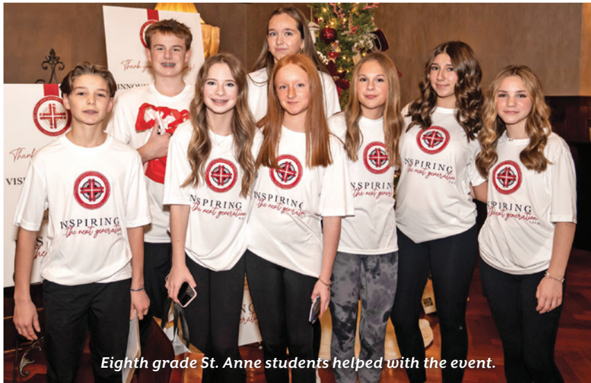
Eighth grade St. Anne students helped with the event.