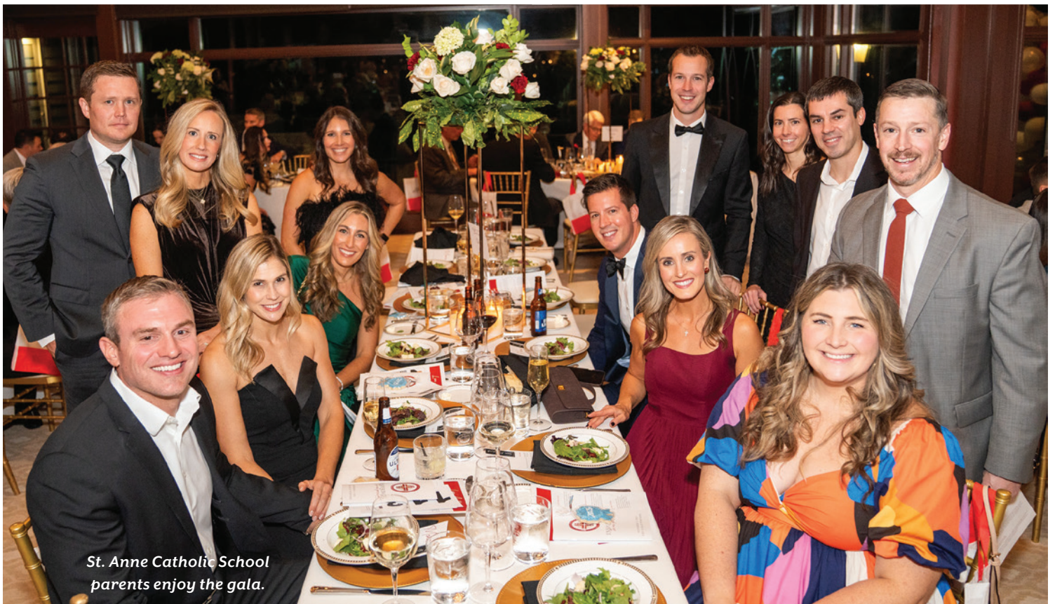
St. Anne Catholic School parents enjoy the gala.