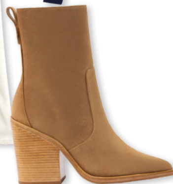
LARROUDÉ Larroude.com, $233