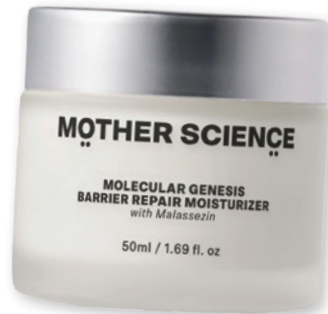
MOTHER SCIENCE MOLECULAR GENESIS BARRIER REPAIR MOISTURIZER Motherscience.com, $68