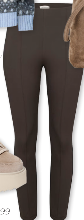
ARITZIA Aritzia.com, $58