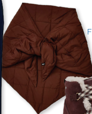
FREE PEOPLE Freepeople. com, $38