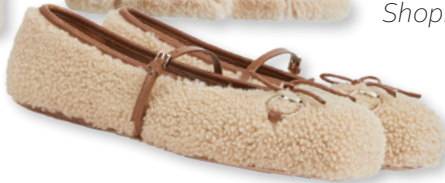
GUCCI Gucci.com, $1,490