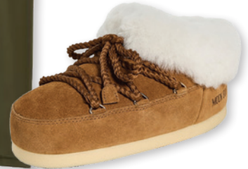
MOONBOOT Shopbop.com, $250