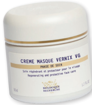
BIOLOGIQUE RECHERCHE CRÈME MASQUE VERNIX VG Biologique-recherche.com, $220