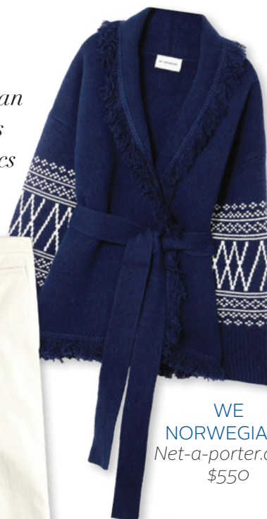
WE NORWEGIANS Net-a-porter.com, $550