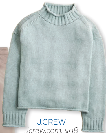
J.CREW Jcrew.com, $98