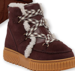
SOREL Sorel.com, $150