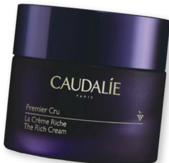
CAUDALIE PREMIER CRU SKIN BARRIER RICH MOISTURIZER WITH BIO-CERAMIDES Goop.com, $119