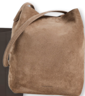
MANSUR GAVRIEL Shopbop.com, $545