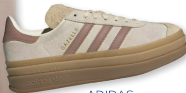
ADIDAS Dickssportinggoods.com, $120