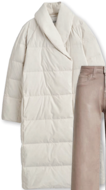
COS Cos.com, $350