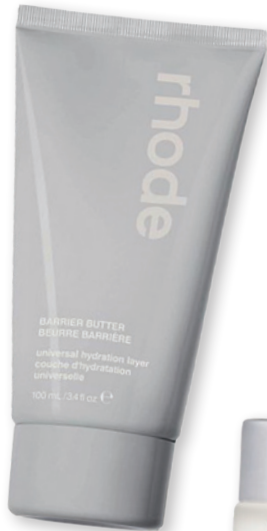
RHODE BARRIER BUTTER Rhode.com, $36