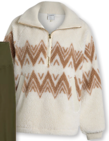
VARLEY Varley.com, $238