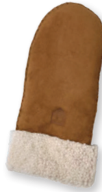
HESTRA Hestragloves.us, $185