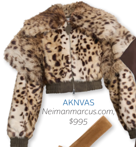
AKNVAS Neimanmarcus.com, $995