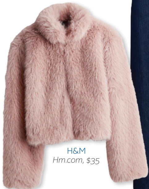
H&M Hm.com, $35