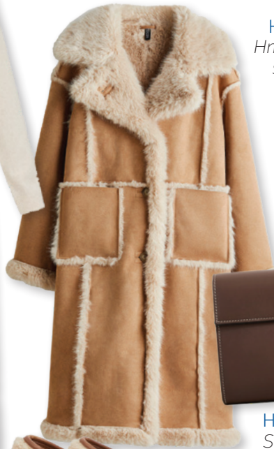
H&M Hm.com, $119