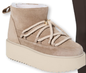
INUIKII Shopbop.com, $299