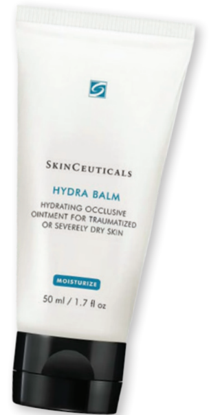
SKINCEUTICALS HYDRA BALM MOISTURIZER OINTMENT Dermstore.com, $25