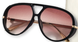
EYEKING Anthropolgie.com, $48