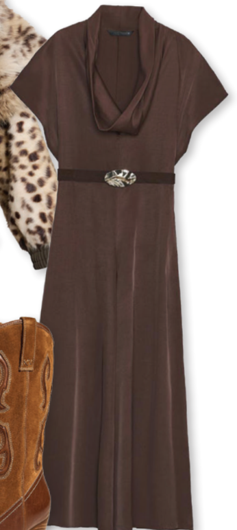
ZARA Zara.com, $100