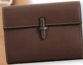
HUNTING SEASON Shopbop.com, $575