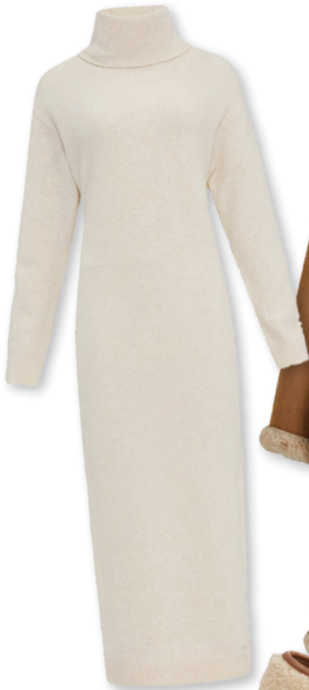
EXPRESS Express.com, $98