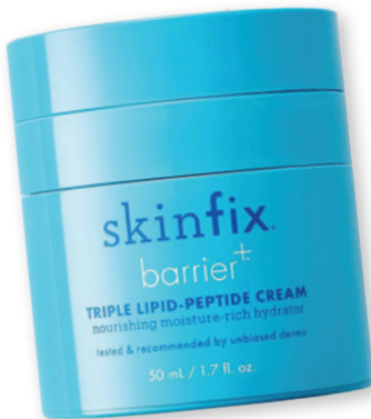
SKINFIX TRIPLE LIPID-PEPTIDE CREAM Amazon.com $40