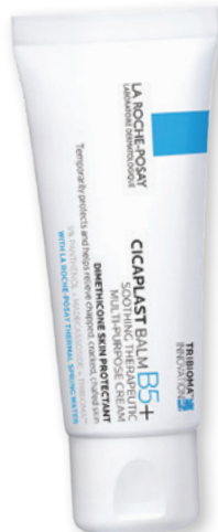
LA ROCHE-POSAY CICAPLAST BALM B5+ Amazon.com, $14