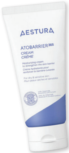
AESTURA ATOBARRIER365 CREAM MOISTURIZER Sephora.com, $32

The frigid temps, cold winds, and drying furnaces never end in winter. The skin barrier needs some extra help to stay hydrated and protected, plus these products help to repair it.