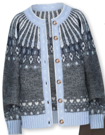
BLANKNYC Bloomingdales.com, $128

While we may not be amongst the mountains, we can take notes from slope style for everyday looks this winter. Cozy layers, heritage prints, and soft fabrics make going out in the cold much more bearable.