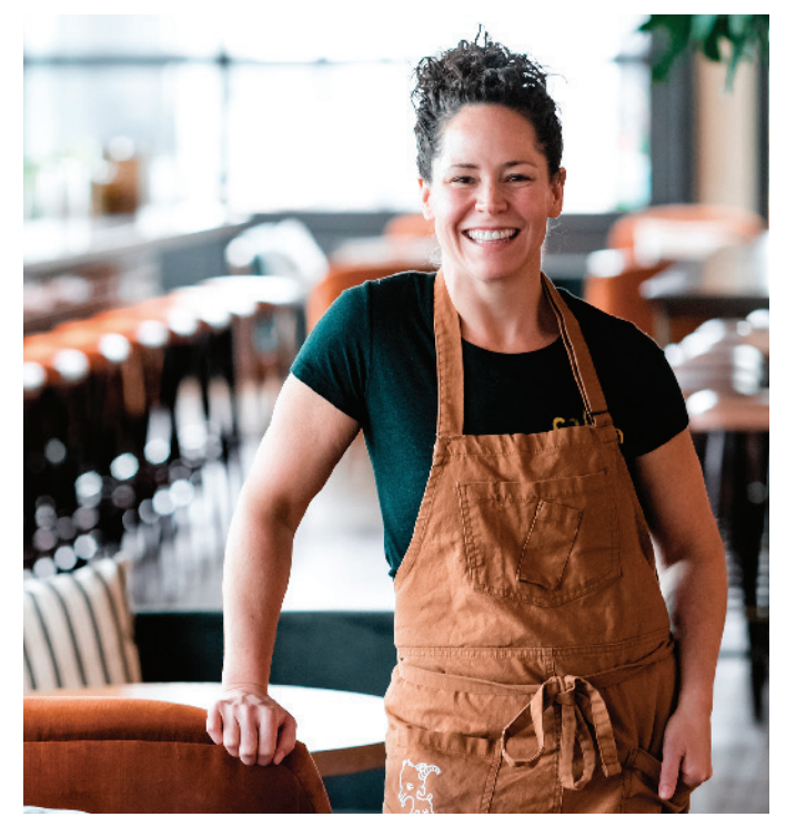
Chef Stephanie Izard.

Marinate the shrimp: In a medium bowl, whisk together the oil, sambal oelek, and garlic. Toss in the shrimp to coat and marinate in the fridge for 1 hour. Heat a large nonstick sauté pan over high heat. Add the shrimp and sear for 2 minutes without tossing. Cook for another 3 minutes, tossing, until the shrimp is bright orange and opaque. Transfer the shrimp to a sheet pan and allow them to cool completely. In a medium bowl, whisk together the mayonnaise, lemon juice, and sauce. When the shrimp are cool, toss them in the flavored mayo to coat.