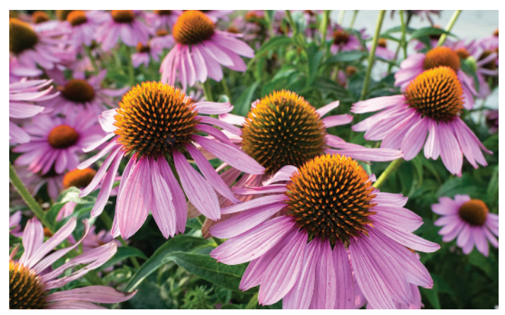
Purple cone flowers are quintessential prairie plants.