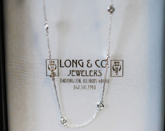
An auction item was generously donated by Long & Co. Jewelers.