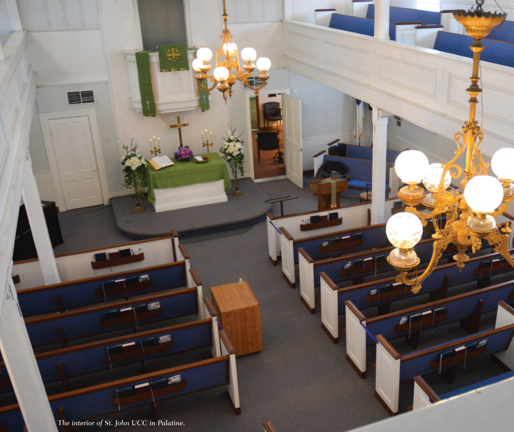
The interior of St. John UCC in Palatine.