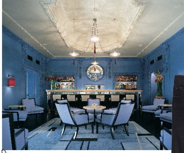
Blue Bar, The Berkeley, London

Combat boots with brass detail you will wear forever as they get better with age. Valentino.com