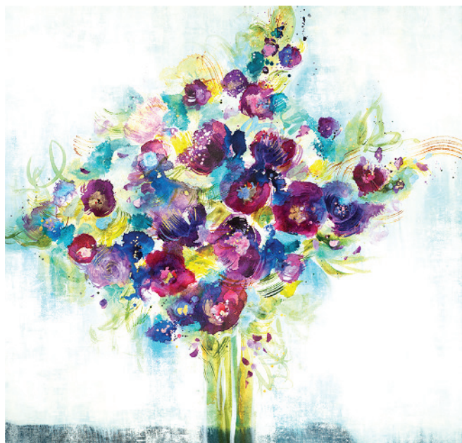
“Violet Fleur” by Hollack