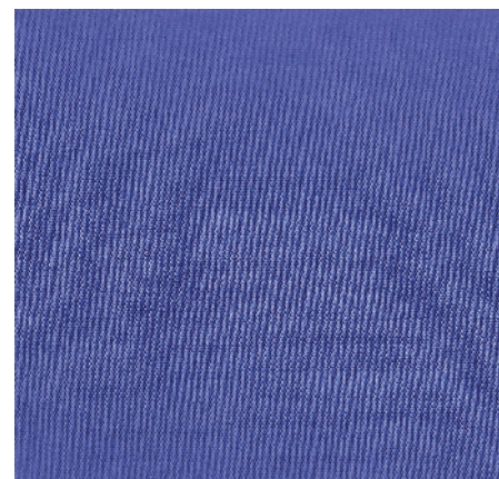
PANTONE's Veri Peri #17-3938 TCX