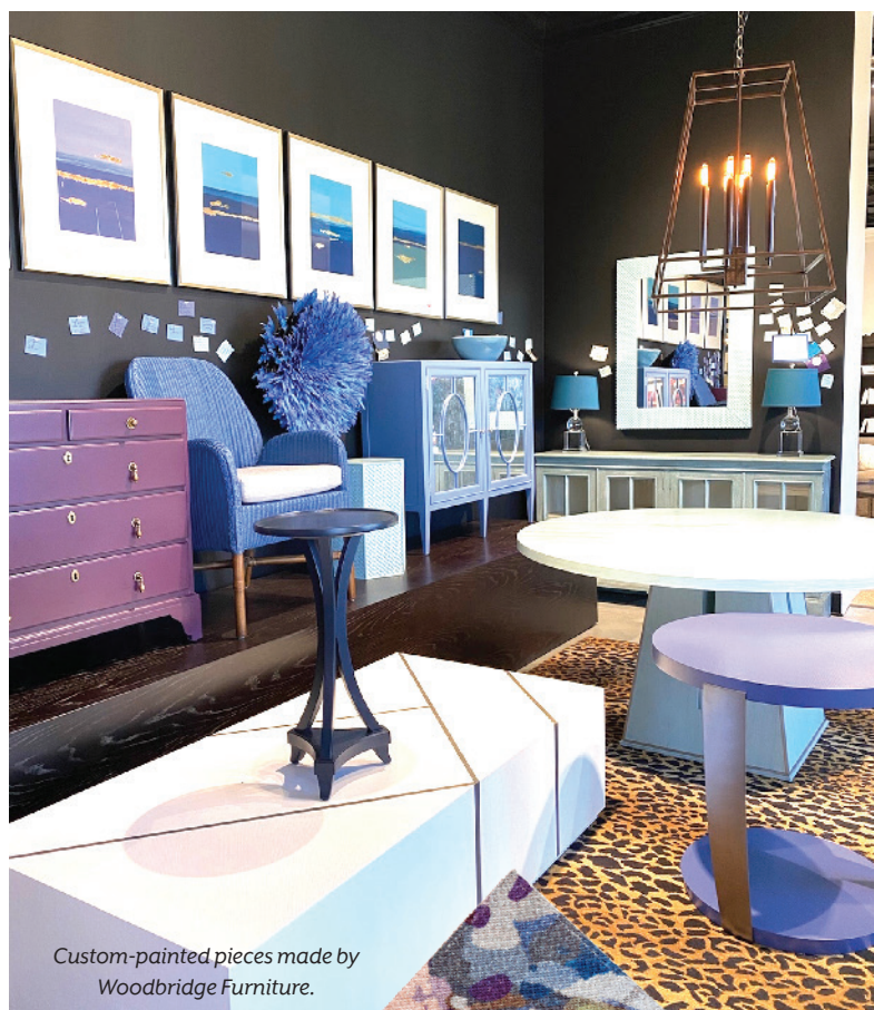
Custom-painted pieces made by Woodbridge Furniture.