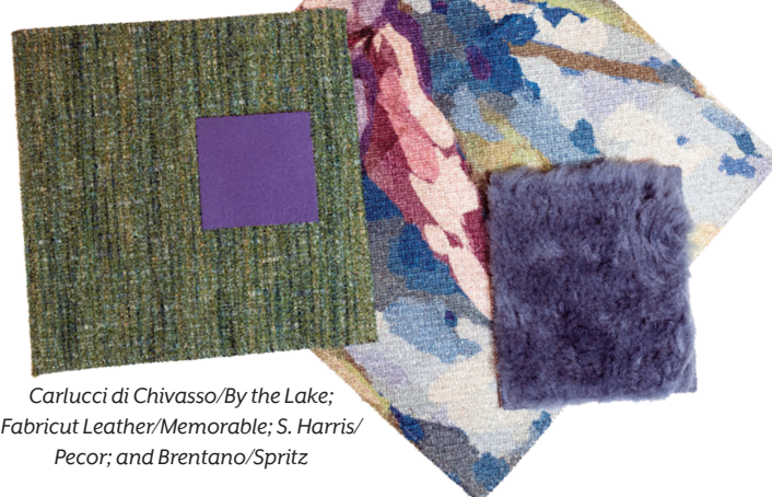
Carlucci di Chivasso/By the Lake; Fabricut Leather/Memorable; S. Harris/ Pecor; and Brentano/Spritz