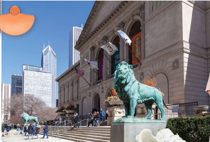
The Art Institute of Chicago—staycation inspiration!

AUGUSTINUS BADER THE FACE CREAM MASK: Take your at-home facial to another level with this product with a cult following. $215. Sephora , Deer Park