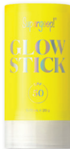
SUPERGOOP GLOW STICK SPF 50+ This easy-to-apply stick is so easy to apply that your kids won't even complain. $26. Sephora, Deer Park