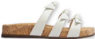
ALEXANDRE BIRMAN LOLITA POOL SANDAL The bows are a sweet touch to this classic walking sandal. $395. Alexandrebirman.com