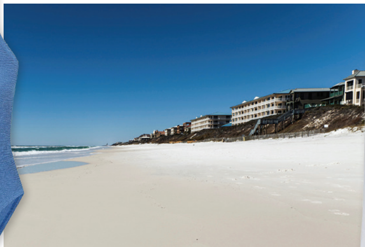
The Gulf Shore along Florida's Highway 30A

ILLESTREVA DELOS ACE SUNGLASSES A gold-mirrored finish always looks polished. $260. Shopbop.com