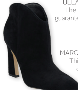
MARC FISHER MASINA SUEDE BOOTIE This has a great modern take on a classic Western bootie. $100. Marcfisherfootwear.com