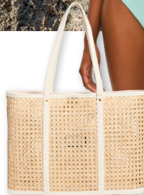
L*SPACE HAMPTONS BAG This bag is roomy enough to be a carry on and to use for your days away. $220. Shopbop.com