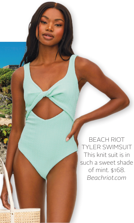
BEACH RIOT TYLER SWIMSUIT This knit suit is in such a sweet shade of mint. $168. Beachriot.com