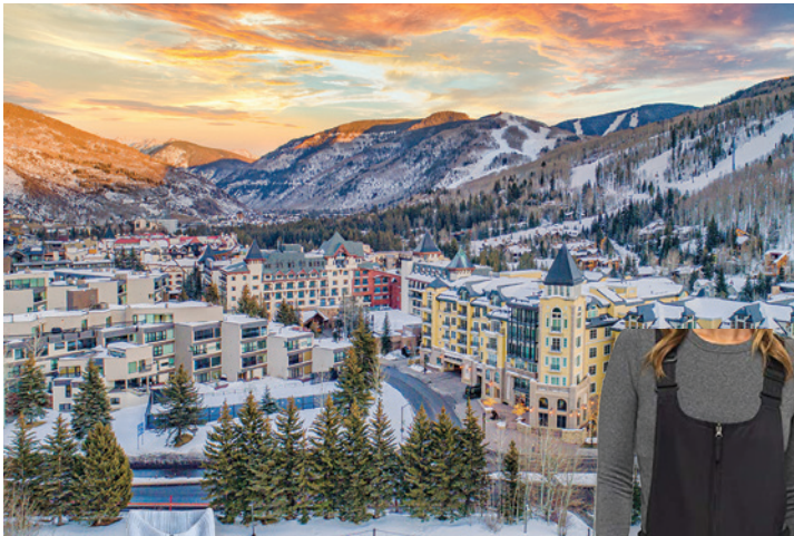
Central Plaza at Beaver Creek