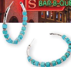
KENDRA SCOTT EMBER EARRINGS Turquoise is such a fun complement to an already colorful look. $98. Kendra Scott, Deer Park