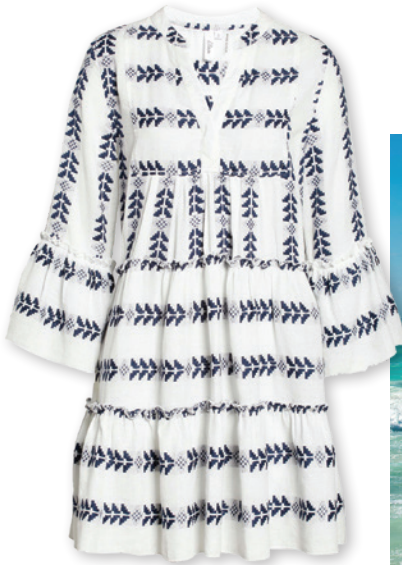
ELAN GRECIAN COVER-UP DRESS A vacation dress that is easy to throw on for the beach or for walking around town. $74. Nordstrom.com