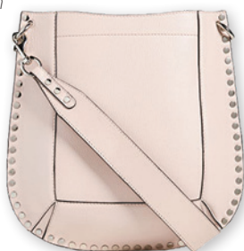
ISABEL MARANT OSKAN BAG This crossbody is a soft neutral pink and great size. $1,150. Shopbop.com