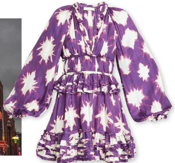
ULLA JOHNSON EMERY DRESS The color and print of this dress guarantees you a great night out. $790. Berdorfgoodman.com