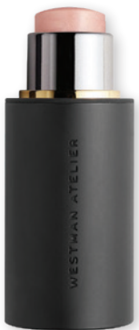
WESTMAN ATELIER LIT UP HIGHLIGHT STICK This clean product gives you that lit-from-within glow. Even if you were out late on Broadway. $48. Nordstrom.com