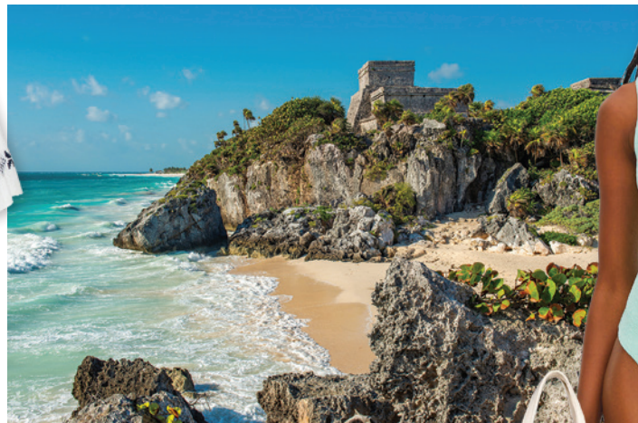
Mayan site in Tulum, Mexico