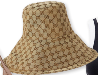
GUCCI Net-a-porter.com $750