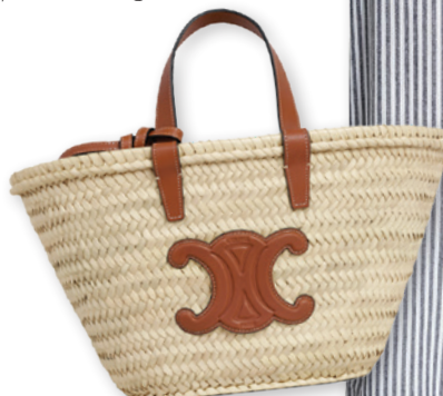
CELINE Celine.com $740