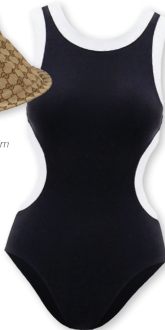
STAUD Staud.clothing $225