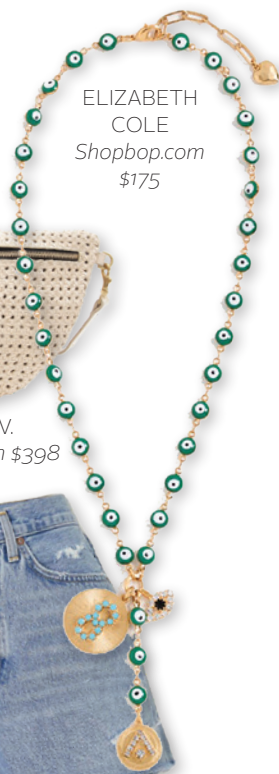
ELIZABETH COLE Shopbop.com $175