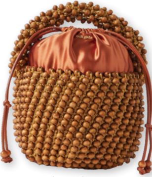
CULT GAIA Net-a-porter.com $398