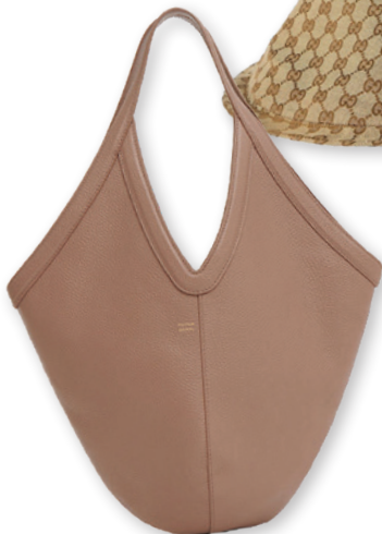
MANSUR GAVRIEL Mansurgavriel.com $745