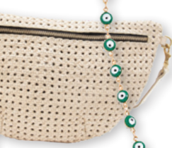
CLARE V. Shopbop.com $398