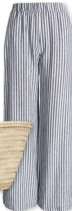
CASLON Nordstrom.com $59