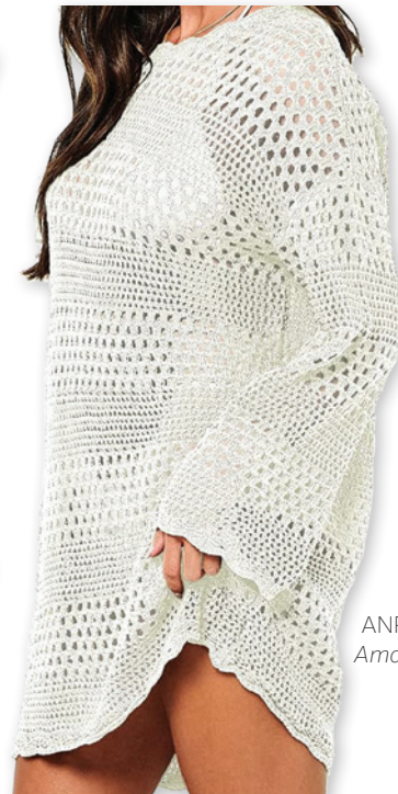
ANRABESS Amazon.com $27