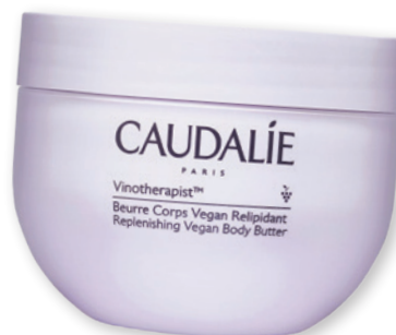
CAUDALIE VEGAN BODY BUTTER Repairs and relieves dry, itchy skin. Sephora.com $38