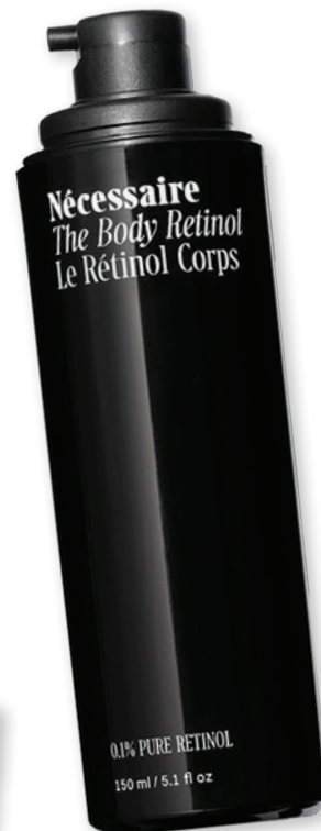
NÉCESSAIRE THE BODY RETINOL Just as with a facial retinol, this combats wrinkles and helps with crepiness. Necessaire.com $55