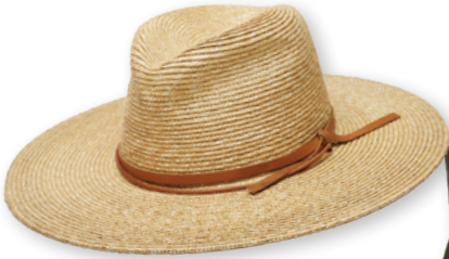
WYETH Wyethusa.com $84