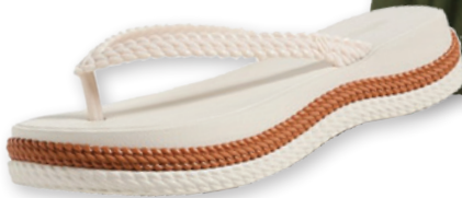
MELISSA Shopbop.com $64