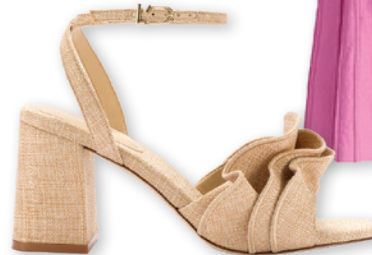
LARROUDÉ Larroude.com $330