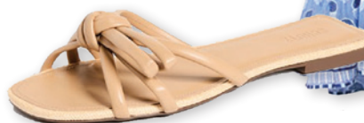
SCHUTZ Shopbop.com $98