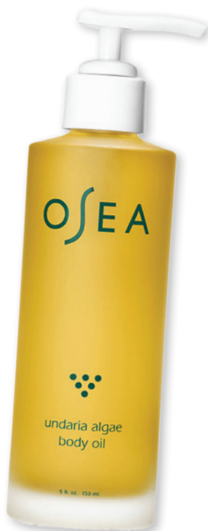
OSEA UNDARIA ALGAE BODY OIL Clinically proven to instantly improve skin elasticity and deliver deep moisturization. Rich yet never greasy, this intoxicating aromatherapy elixir enhances every inch. Blue Mercury Barrington $52

The dry winter weather does a number on skin. These products can help you rejuvenate so you are ready for shorter sleeves and hems.