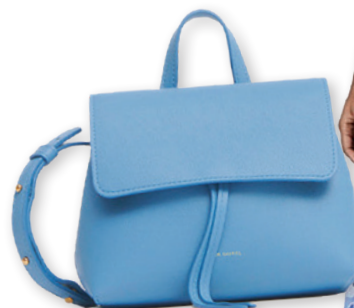
MANSUR GAVRIEL Mansurgavriel.com $495