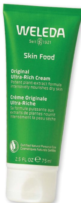
WELEDA SKIN FOOD Slather this rich cream on hands and feet before bed and wake up to soft, summer ready skin. Heinen's Barrington $18