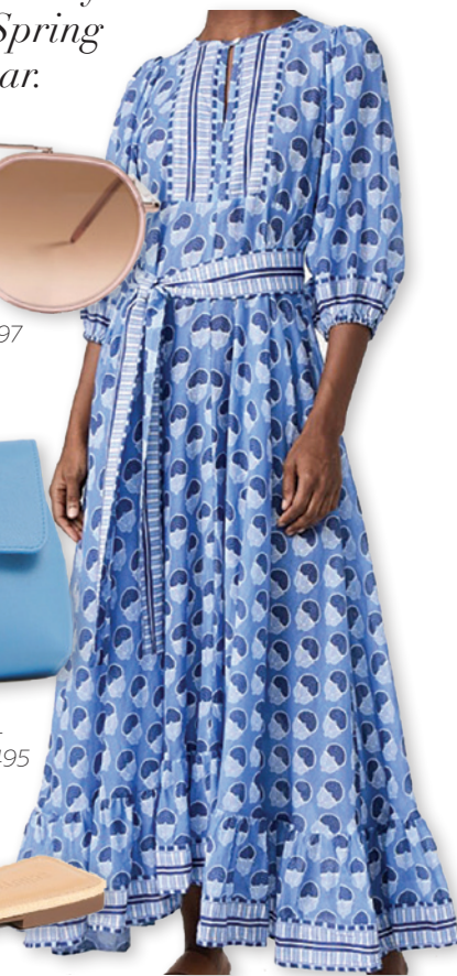
MAREA Shopbop.com $268