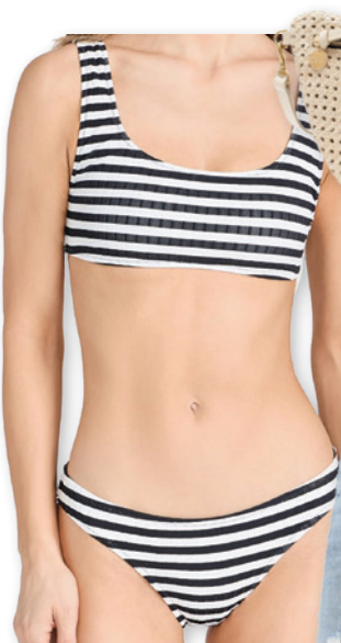
SOLID & STRIPED Shopbop.com $98