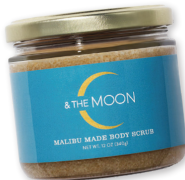
C & THE MOON MALIBU MADE BODY SCRUB Packed with essential oils and Alpha Hydroxy, this scrub will not only smooth, but heal skin. Violetgrey.com $64