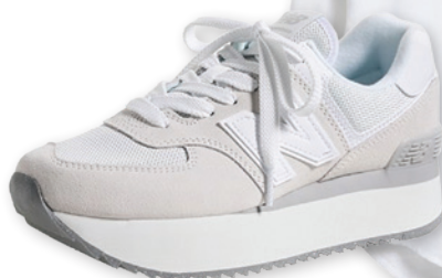
NEW BALANCE Shopbop.com $99