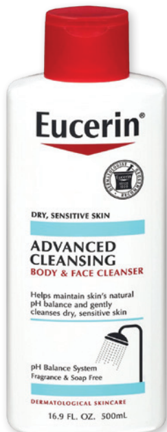
EUCERIN ADVANCED CLEANSING BODY & FACE CLEANSER Cleanse without stripping your skin's natural barrier with this double duty product. Amazon.com $12