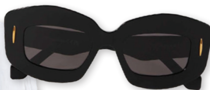
LOWE Net-a-porter.com $380