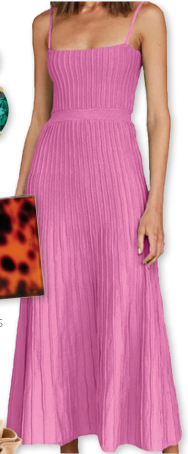
UUSOLLECY Amazon.com $40