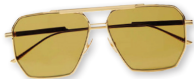
BOTTEGA VENETA Net-a-porter.com $440

Adding in new vacation pieces is always fun for a getaway. Choose classic pieces you can incorporate into your Spring and Summer looks for the best investment this year.