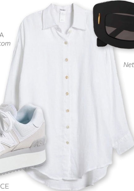
VITAMIN A Nordstrom.com $148