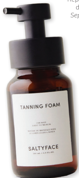
SALTYFACE TANNING FOAM Vegan and sulfate free, this clean self-tanner is streak free and melts into skin. Saltyface.com $62