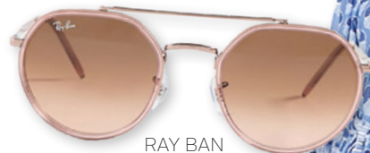
RAY BAN Shopbop.com $197