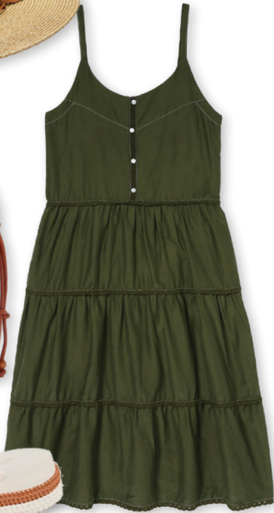
WYETH Shopwyeth.com $198