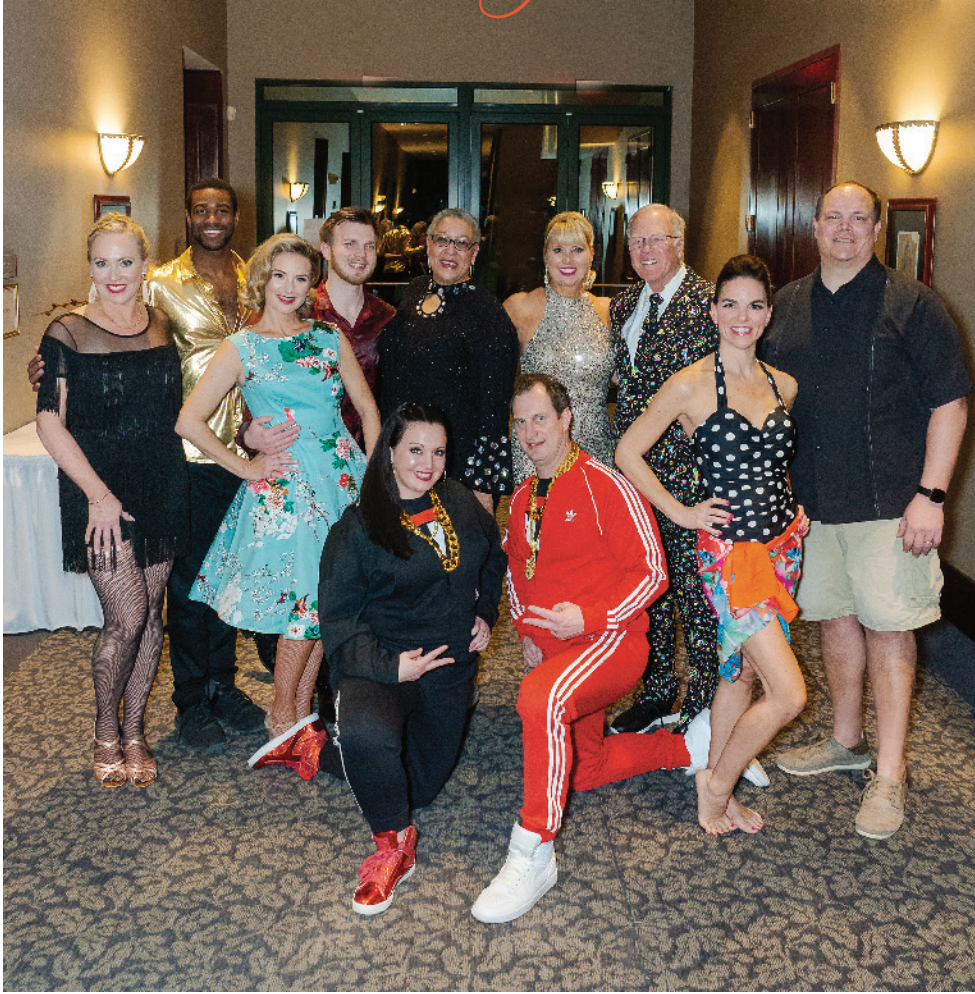
The 2020 Dancing with the Barrington Stars Dancers