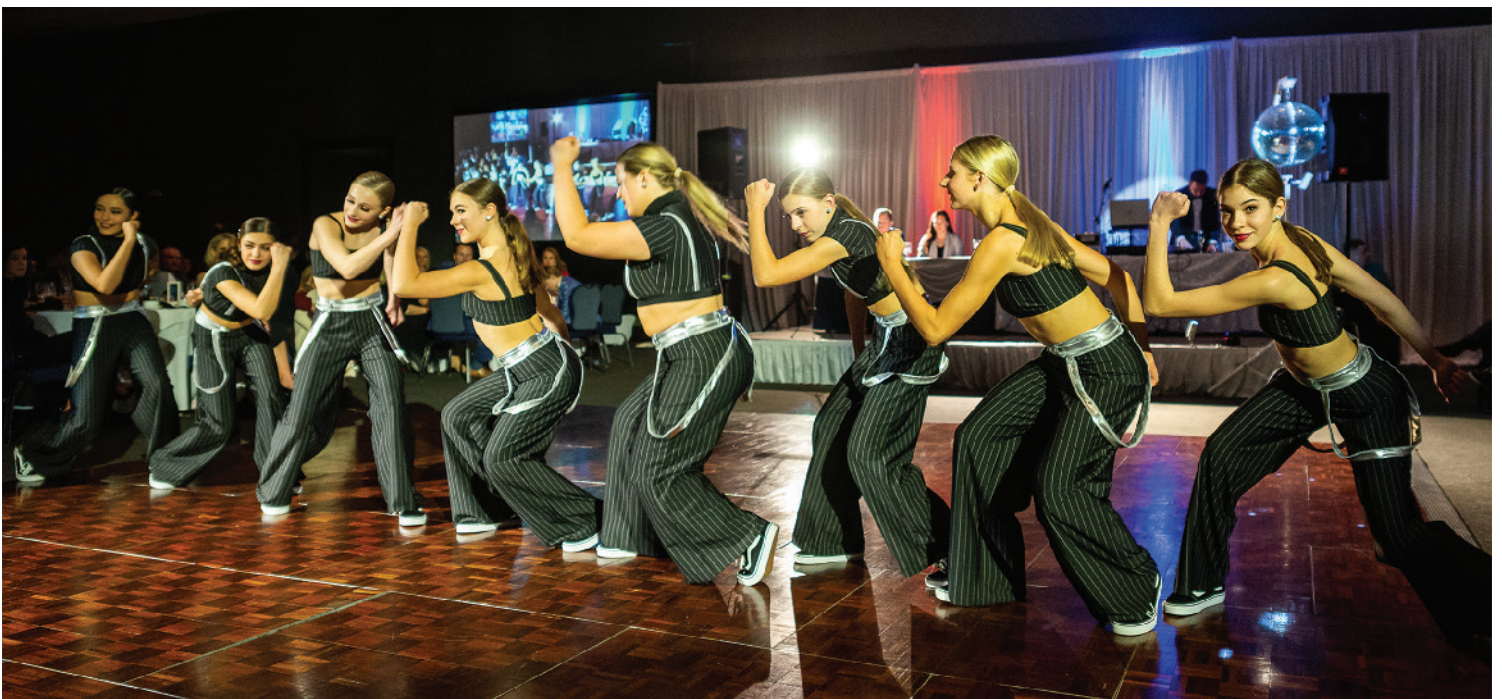
Bataille Academie dancers wowed the crowd.